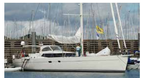
BENIGUET Garcia 86 QR 26.33 m 2005 Location: Marseille, South of France 1,495,000 €