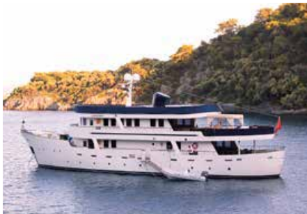
DONA DEL MARE New Classic 34.10 m 2006 Location: Croatia 3,200,000 €