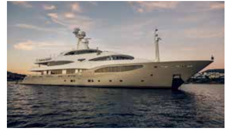
LIGHT HOLIC 60.00 m 12/15 Caribbean 360,000/320,000 €/week