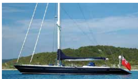
DARK STAR OF LONDON Aluminium Centre Board Cutter Rig 27.50 m 1982 Location: Port Napoleon, South of France 790,000 €