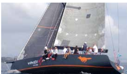
COYOTE Botin Carkeek 52 15.50 m 2001 Location: Marseille, South of France 195,000 €