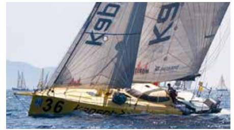
AUSTRIAN ONE Ex Imoca 60 18.28 m 1995/2012 Location: Split, Croatia 195,000 €