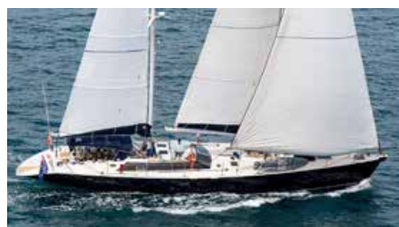
ENTHALPIA Garcia Aluminium Ketch 21.60m 1992|2015 Location: Marseille, South of France 550 000 €