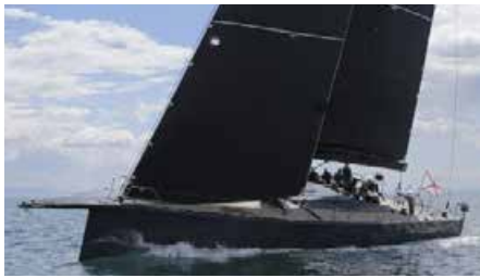
HIGH SPIRIT Botin 65 20.00 m 2015 Location: Valencia, Spain 2,900,000 €