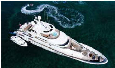
W 39.62 m 10/7 Bahamas, Florida 145,000/135,000 USD/week