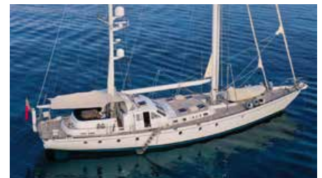
ACOA 92 ft Ed Dubois Ketch 28.00 m 1985 Location: Propriano, Corsica 1,335,000 €