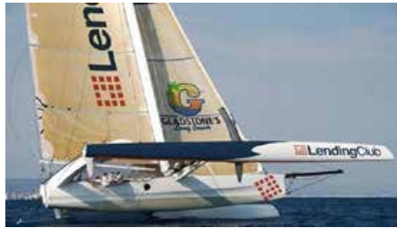
TRITIUM 72ft Ultime VPLP Design 23.38 m 2002 Location: California 495,000 US$