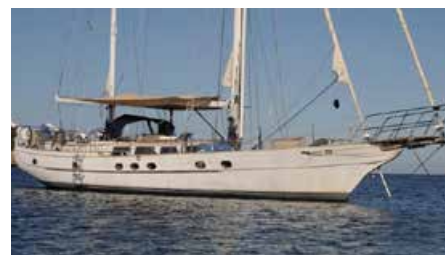
TARA BAY Scorpio 72 21.60 m 1991 Location: Marseille, South France 390,000 €