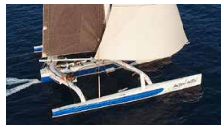
AKRON AOTON Orma 60 18.28 m 1998 Location: Greece 275,000 €