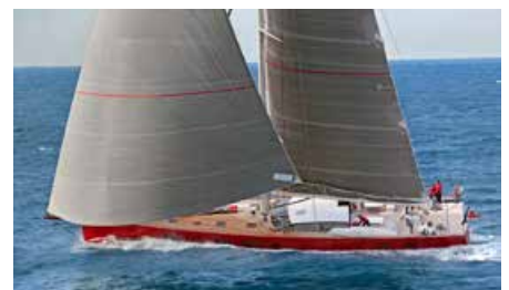
NOMAD IV 30.48 m 12/4 French Polynesia 56,000/52,000 €/week