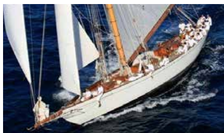
MOONBEAM IV 32.00 m 6/6 West Mediterranean 39,000 €/week