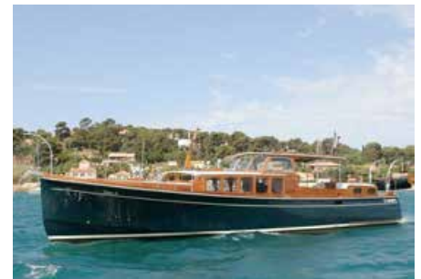
DONA A Andreyale 52 16.60 m 2001 Location: Toulon 500,000 €