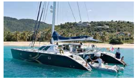
LA PERLA 20.60 m 6/2 Balearic Islands 23,000/18,000 €/week