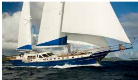
QUEEN SOUTH III Oceangoing Ketch 35.97 m 1999, Refit 2013 Location : La Seyne, South of France 1,490,000 €