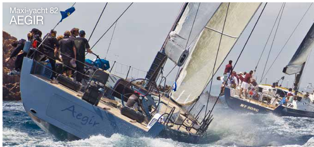
Maxi-yacht 82 AEGIR

Finishing 1st in IRC 1 at the Palma Vela Regatta in 2017, AEGIR has proven once again her full potential on the Maxi Racing Circuit!