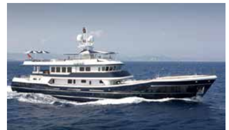
THE MERCY BOYS 48.60 m 12/11 West & East Mediterranean 106,250/93,750 €/week