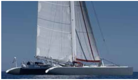
OCEAN PEARL Maxi Catamaran 33.50 m 2000 Location: Barcelona, Spain 2,450,000 €