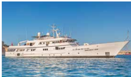
SANSSOUCI STAR 53.50 m 12/8 West & East Mediterranean 70,000 €/week