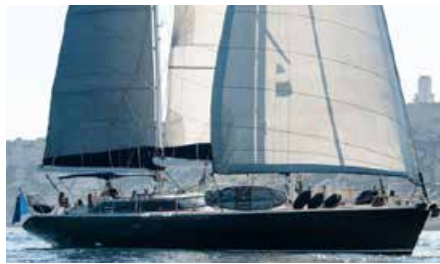
ENTHALPIA 21.60 m 8/3 East/West Mediterranean 15,000/12,000 €/week