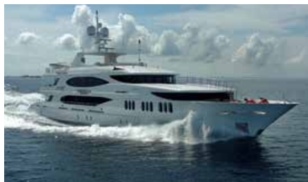
AMARULA SUN 50.00 m 12/9 Bahamas, Florida and Caribbean 230,000/195,000 USD/week