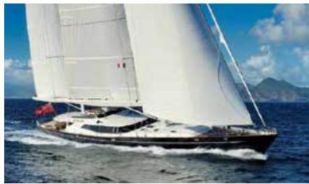
Name: DRUMBEAT Length: 53.00 m Guest/Crew: 11/10 Area: Tahiti Rate (high/low): 175,000 USD/week