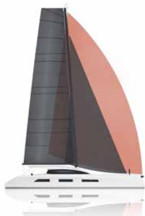
Rendering Linea Concept