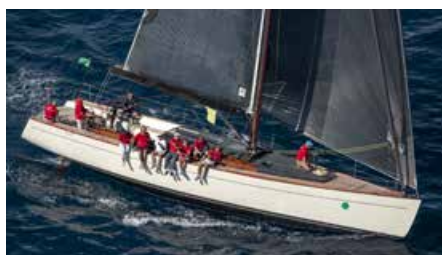
TOFINOU Tofinou 16 15.90 m 2018 Location: Saint-Tropez, South of France 850,000 €