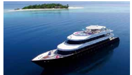
AZALEA 38.75 m 18/13 Maldives 49,000 €/week