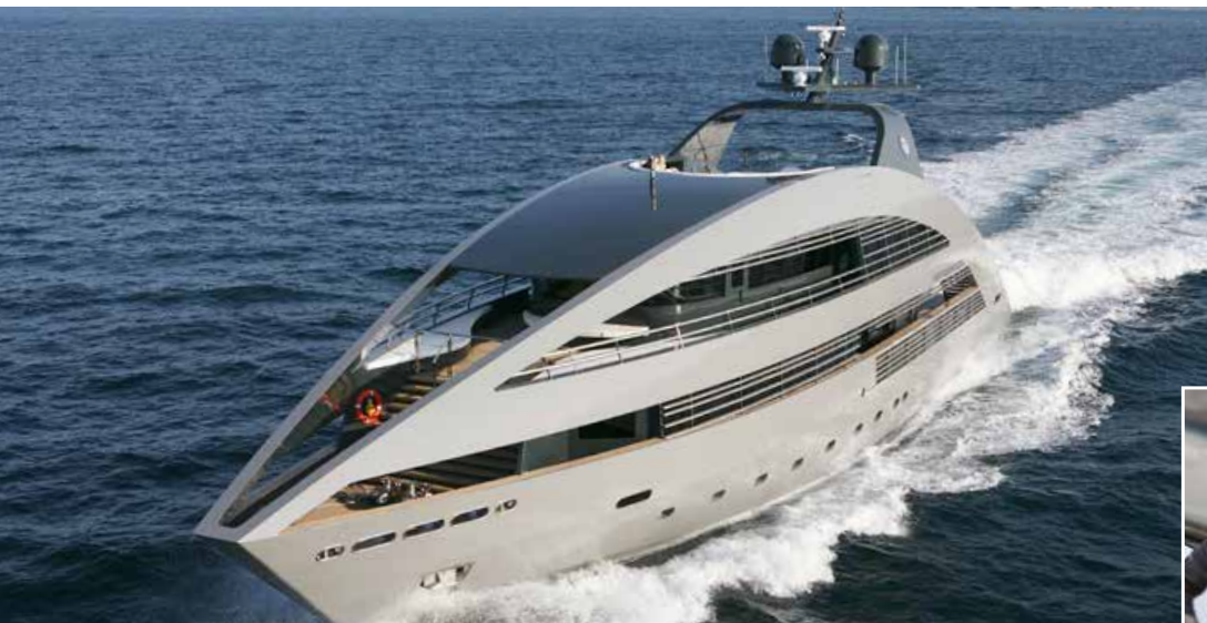
135ft Sir Norman Foster Design OCEAN SAPPHIRE, p. 5