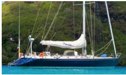
MARICEA 23.26 m 8/3 West Mediterranean 11,000 €/week