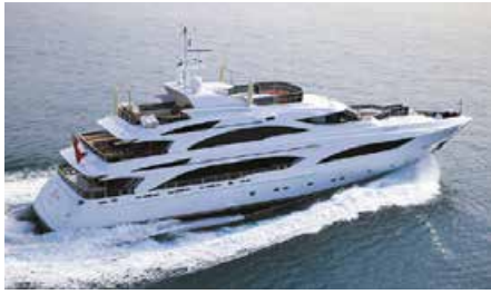
DIANE 43.00 m 10/8 Spain, Balearic Islands 150,000/135,000 €/week