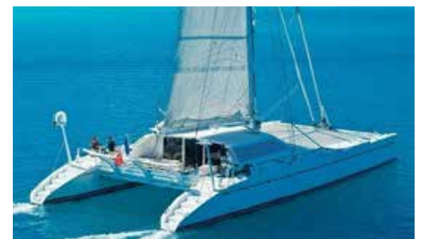
MAGIC CAT 25.00 m 8/4 West Mediterranean 35,000 €/week