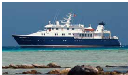
HANSE EXPLORER 47.76 m 12/14 South America and Antartic Peninsula 155,000/135,000 €/week