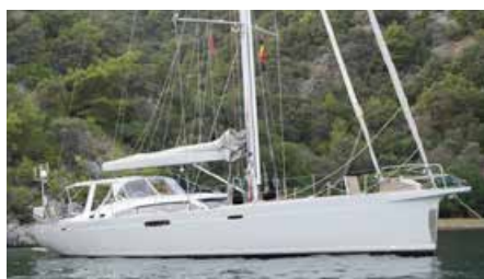
MARY BLUE III Garcia Yacht 65 20.13 m 2008 Location: Barcelona, Spain 695,000 €