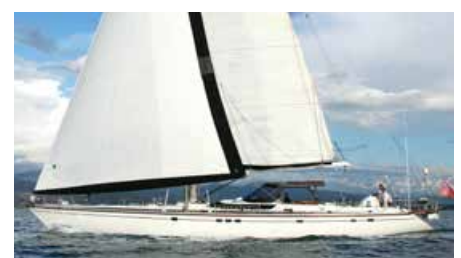
WILD SALMON Locwind 80 24.00m 1997 Location: Port Napoleon, South of France 450,000 €