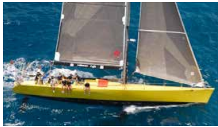
CHESSEA Volvo 60 19.50 m 1997 Location: Sete, South of France 345,000 €