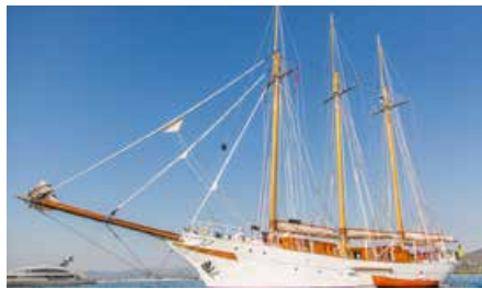
TRINAKRIA 49.06 m 10/8 West Mediterranean 80,000/70,000 €/week