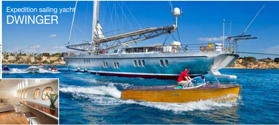
Expedition sailing yacht DWINGER