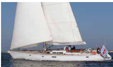
DJANGO TOO 24.98 m 8/3 West Mediterranean 22,000/18,000 €/week