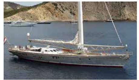
DWINGER 48.50 m 11/7 Balearics, Spain 75,000/70,000 €/week