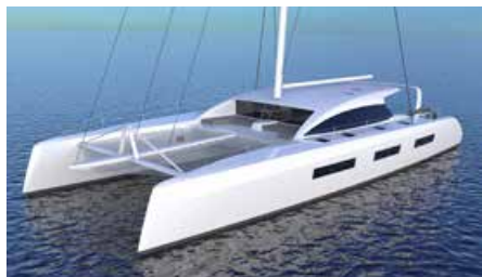
GP 70 GP 70 21.00 m 2018 Location: Portugal P.O.A.