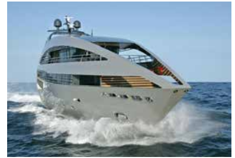
OCEAN SAPPHIRE Norman Foster Design 41.10 m 2010 Location: Cannes, South of France 5,900,000 €