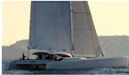
LORD DICKIE Velum 72 22.00 m 2009, Refit 2018 Location: Port Napoleon, South of France 590,000 €