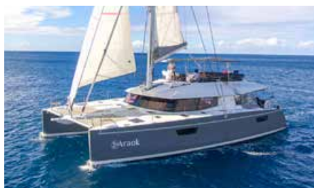
ARAOK 17.80 m 8/2 West Mediterranean & Caribbean 28,000/24,000 €/week