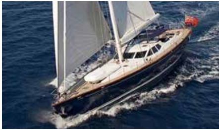
MARGARET ANN 29.10 m 8/4 East/West Mediterranean 40,000/37,000 €/week