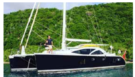
CURANTA CRIDHE 15.30 m 6/2 West Mediterranean 16,000/15,000 €/week