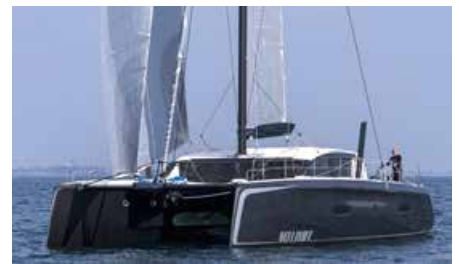
NO LIMIT 18.30 m 6/2 Caribbean 18,000/16,000 €/week