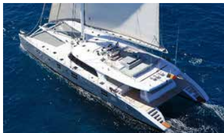
CHE 34.70 m 8/6 Caribbean 85,000/75,000 €/week