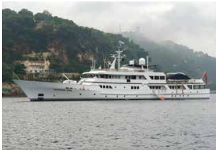
SANSOUCCI STAR Steel/Aluminium Large Motor Yacht 53.53 m 1982 Location: Sète, South of France 2,900,000 €