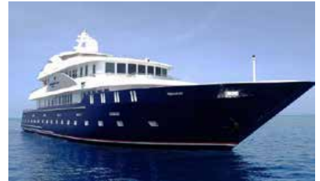
DHAANKAN'BAA 40.00 m 14/17 Maldives 95,000/85,000 USD/week