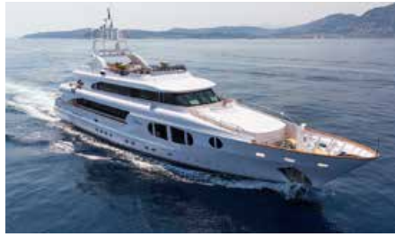
BINA 43.25 m 12/9 West Mediterranean 175,000/150,000 €/week