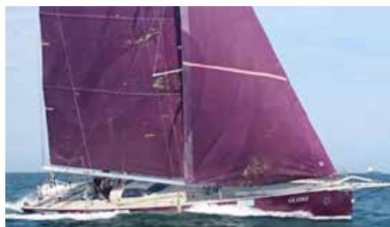
GLOBE Ex Imoca 60 18.28 m 1992 Location: Gdansk, Poland 130,000 €