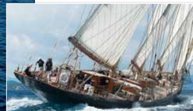
Atlantic, p. 7