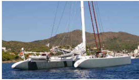
OCEAN PEARL Maxi Catamaran 33.50 m 2000 Location: Barcelona, Spain 2,490,000 €