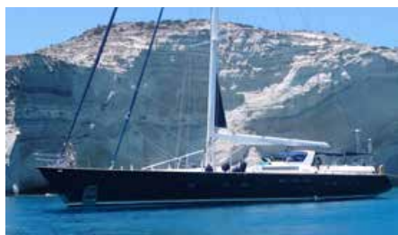
AMADEUS 33.50 m 12/6 Greece 45,500/38,500 €/week