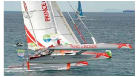
PRINCE DE BRETAGNE Ultim 80 24.38 m 2012 Location: Brittany, France 790,000 €