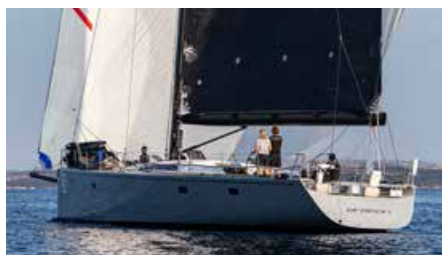
ARAGON Reichel Pugh 72 22.00 m 2006 Location: Palma 1,250,000 €