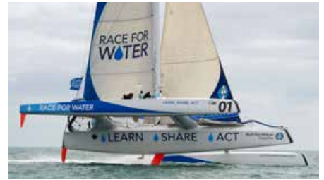
RACE FOR WATER MOD 70 21.20 m 2011 Location: Brittany, France 1,200,000 €