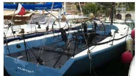
FURTIF 2 Farr 52 Performance 15.79 m 2002 Location: Toulon, South of France 140,000 €