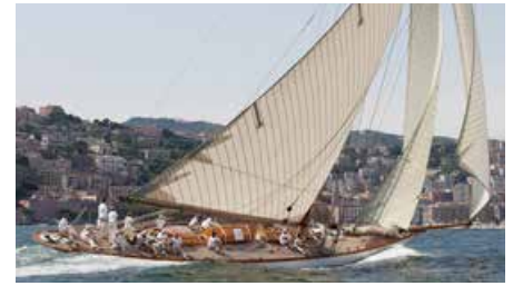
MARIQUITA William Fife III Design 38.10 m 1911, Refit 2003 Location: Lymington, England 2,750,000 €