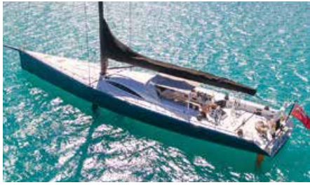
LEOPARD 30.50 m 8/5 West Mediterranean 48,000 €/week