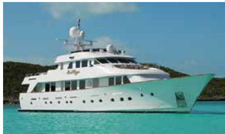
SWEET ESCAPE 39.62 m 12/8 Bahamas 115,000/99,000 USD/week