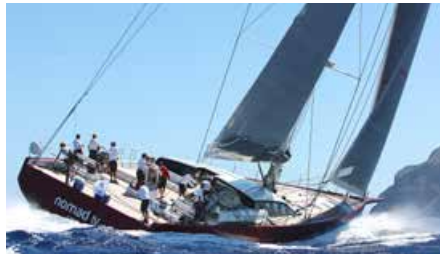
NOMAD IV Maxi Dolphin 30.48 m 2013 Location: La Seyne, South of France 5,900,000 €