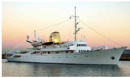
Name: CHRISTINA O Length: 99.13 m Guest/Crew: 34/38 Area: Caribbean Rate (high/low): 700,000 €/week