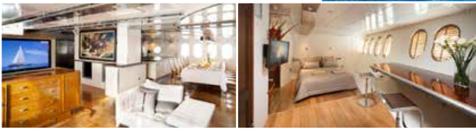
Maxi Catamaran MAGIC CAT