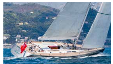
ELISE WHISPER 24.00 m 8/3 West Mediterranean 25,000 €/week