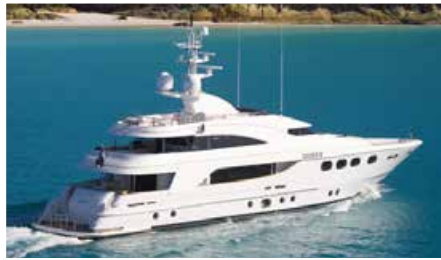
DE LISLE III 42.00 m 9/7 South Pacific 125,000 USD/week