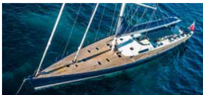
This year BGYB will exhibit BLUE DIAMOND in Port Canto (stand BROKER 045)

WHIRLWIND will at anchor in the Bay of Cannes. A tender service will be available to bring you aboard for viewings.