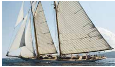
ELEONORA Classic Gaff Schooner 49.50 m 2000, Refit 2008 Location: Spain P.O.A.