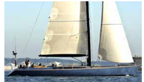
WALLY ONE 25.30 m 8/3 West Mediterranean 24,000/18,000 €/week