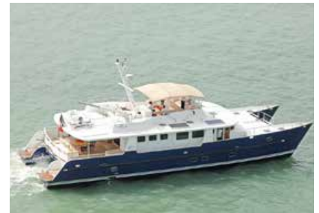
PELICANO YC 80 Jouvert-Nivelts Design 23.95 m 2005 Location: Sète, South of France 890,000 €