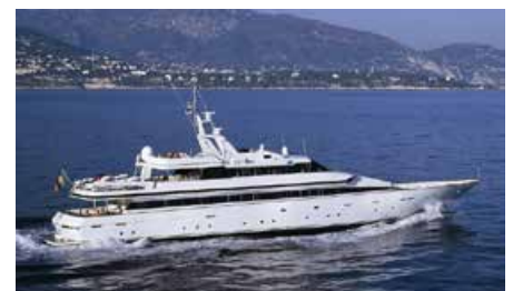
COSTA MAGNA 44.50 m 10/8 West Mediterranean 96,000/90,000 €/week