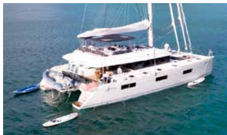
MELARNIE 18.90 m 8/3 West Mediterranean 28,000/26,000 €/week