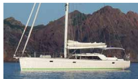
LEVITHA Azzuro 53 16.85 m 2007 Location: South of France 445,000 €