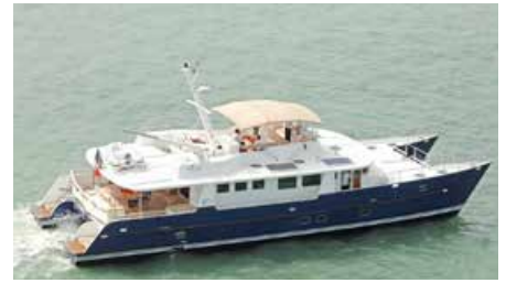
PELICANO YC 80 Jouvert-Nivelt Design 23.95 m 2005 Location: Sète, South of France 890,000 €