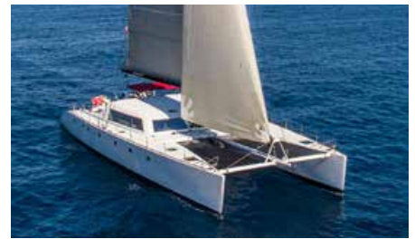
TAJ 24.00 m 6/3 Caribbean 31,000/27,000 €/week