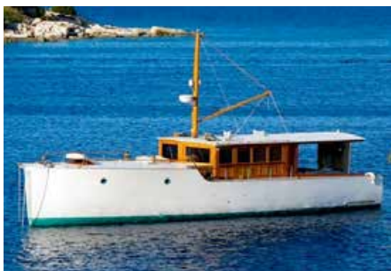
MISTY New Classic Commuter 15.3 m 2013 Location: France 290,000 €