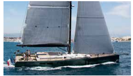
SHAMLOR 22.40 m 6/2 West Mediterranean 16,000/15,000 €/week