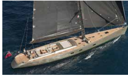
DARK SHADOW 30.45 m 6/4 Caribbean 45,000/40,000 €/week