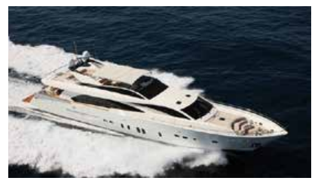
LADY EMMA 34.10m 8/4 West Mediterranean 72,000/69,000 €/week