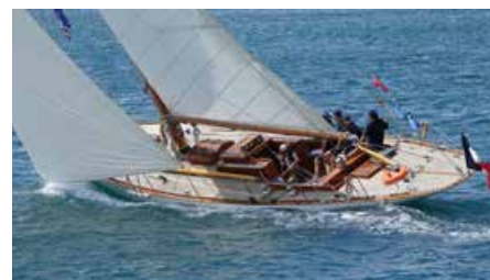
LASSE Bermudan Cutter Sloop 18.28 m 1940 Location: West Coast of France 310,000 €