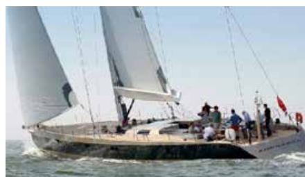
ZURBAGAN Lifting Keel Sloop 27.40 m 2006 Location: Palma de Mallorca 1,400,000 €