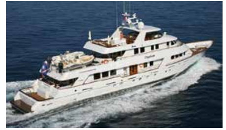
DAYDREAM 42.60 m 10/7 Northern Europe 99,000/89,000 €/week