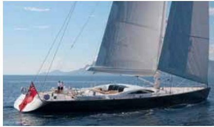
HEUREKA 45.00 m 6/6 East/West Mediterranean 93,500/82,500 €/week