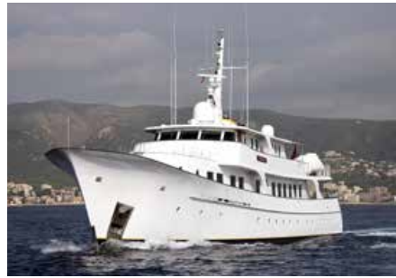
KRISS Abeking & Rasmussen Built 45.00 m 1974, Refit 2017 Location: Malta 6,000,000 €