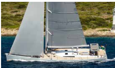
IKIGAI 25.13 m 6/2 Caribbean/Mediterranean 32,000/28,000 €/week