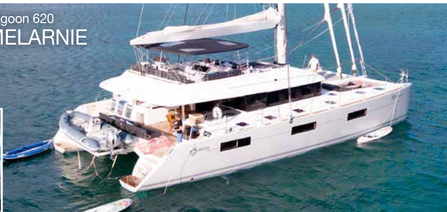
Lagoon 620 MELARNIE