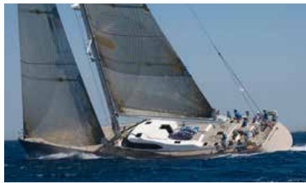
SKIP'N BOU 24.00 m 6/3 Mediterranean 28,000/24,000 €/week