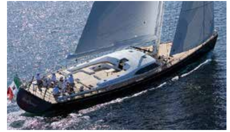
FAR & WIDE 30.20 m 8/4 East/West Mediterranean 50,000/46,000 €/week