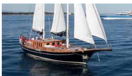
SMART SPIRIT Steel Ketch 25.80 m 2004 Location: Marseille, South of France 590,000 €