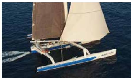
AKRON AOTON 18.28 m 6/3 Greece P.O.A