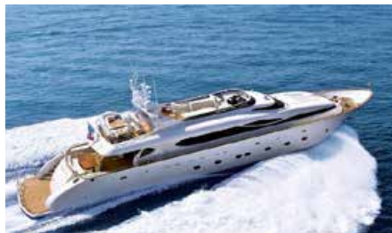
PARIS A 35.00 m 12/6 East Mediterranean 73,000/63,000 €/week