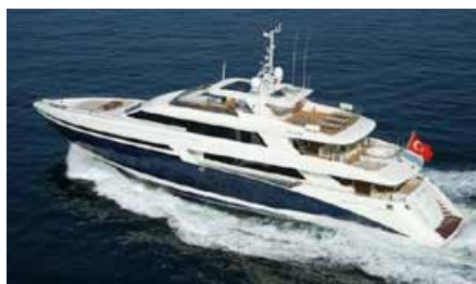
TATIANA 44.90 m 12/9 East & West Mediterranean 165,000/150,000 €/week