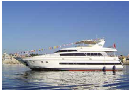
ABOU MAYA Monte Fino 83 25.29 m 1994 Location: Marocco 290,000 €