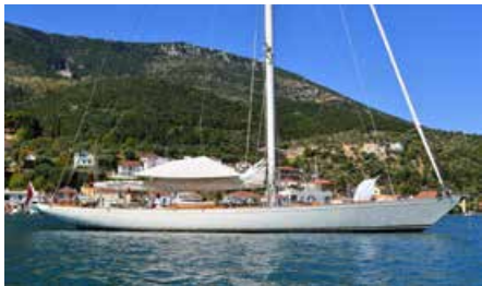
WHITEFIN 27.43 m 8/4 West Mediterranean 28,500/25,500 €/week