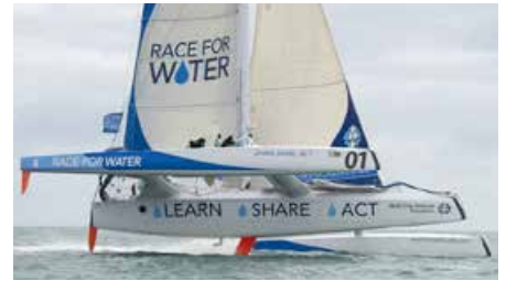
RACE FOR WATER MOD 70 21.20 m 2011 Location: Lorient, France 1,200,000 €