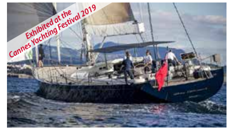
BLUE DIAMOND Bermudian Sloop 30.00 m 2004 Location : Palma, Spain 2,700,000 €