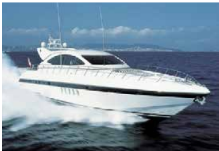
HALKIN Mangusta 72 1999 Location: Menton, South France 490,000 €