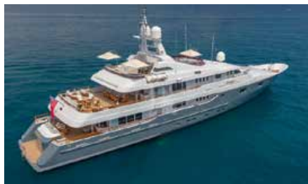
MOSAIQUE 49.90 m 12/12 Caribbean 180,000/160,000 USD/week