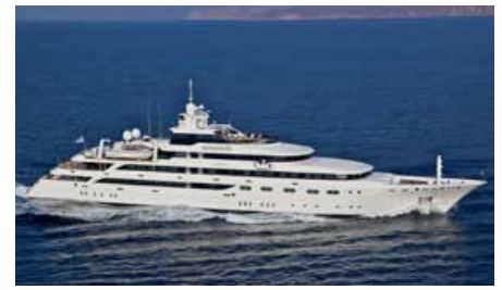
TITANIA 73.00 m 12/21 Caribbean 635,000/495,000 USD/week