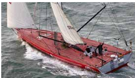
COME IN VENDEE Ex Imoca 60 18.28 m 1997 Location: West France 99,000 €