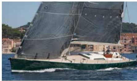
GENIE 24.00 m 6/3 West Mediterranean 24,000 €/week