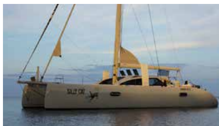
SILLY CAT ICE CAT 61 18.60 m 2018 Location: Sète, South of France 1,490,000 €