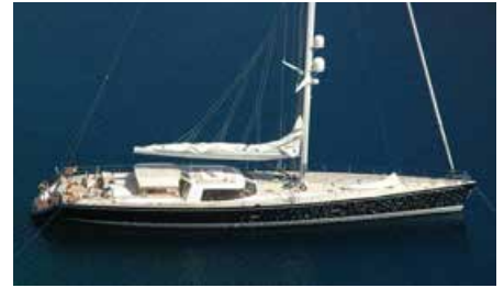
VAIMITI 39.20 m 8/5 Caribbean 65,000 €/week