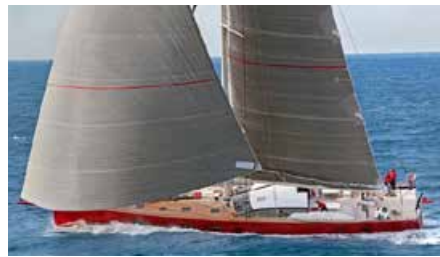
NOMAD IV Maxi Dolphin 30.48 m 2013 Location: La Seyne, South of France 5,900,000 €