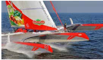
PRINCE DE BRETAGNE Ultim 80 24.38 m 2012 Location: Brittany, France 790,000 €