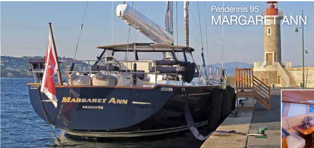
Pendennis 95 MARGARET ANN

2004/Refit 2013 - Length: 29.15m - Guest/Crew: 8/4 Margaret Ann is a classic style 95.5 foot sailing yacht able to sleep up to 8 guests as well as the 4 reliable and capable crew members.