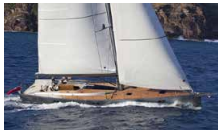
AEGIR 25.10 m 7/3 West Mediterranean 32,000/27,000 €/week