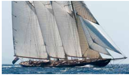
ATLANTIC New Classic Schooner Repliqua 64.50 m 2010 Location: Italy P.O.A.