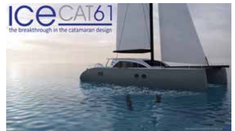
ICE CAT 61 New Cruising catamaran 18.60 m 2019 Location: Italy P.O.A.