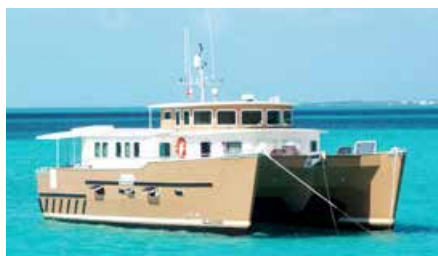
GLAZMOR Expedition Power Catamaran 18.60 m 2009 Location: Port Napoleon, South of France 590,000 €