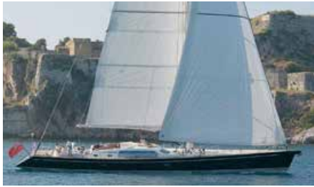
GRAND BLEU VINTAGE 29.00 m 8/4 East & West Mediterranean 43,000/39,000 €/week