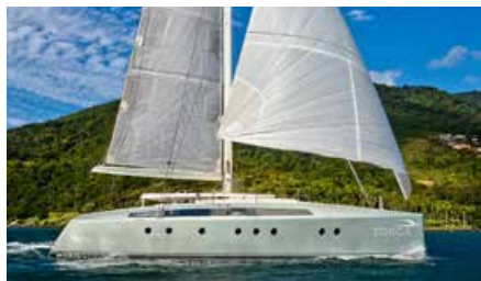
TOSCA Moxie 61 18.95 m 2011 Location: Caribbean 1,350,000 €