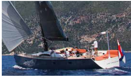
ARAGON Reichel Pugh 72 22.00 m 2006 Location: Palma 1,250,000 €