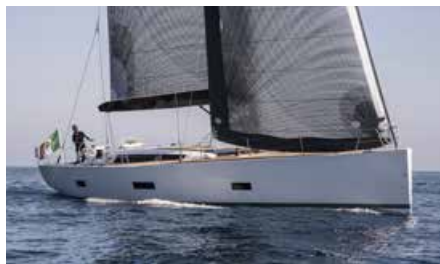
SUENO 18.82 m 6/2 West Mediterranean 15,000 €/week