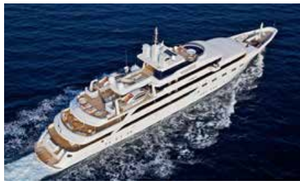
O'MEGA 82.50 m 30/28 Caribbean 480,000/450,000 €/week