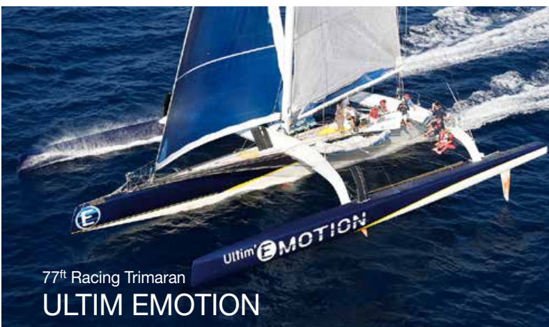
77ft Racing Trimaran ULTIM EMOTION

2001 - Length: 23.38 m - Guest/Crew: 12/3