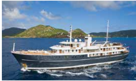
SHERAKHAN 69.65 m 26-28/19 Caribbean 425,000/390,000 €/week