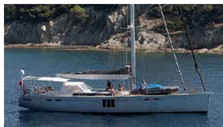
DYNASTY Hanse 630 19.80 m 2007 Loc: Port St Louis du Rhône, South of France 490,000 €