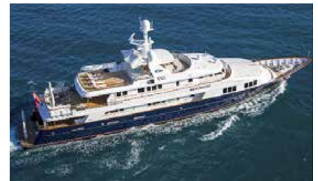
BROADWATER 50.29 m 12/12 Caribbean 280,000/260,000 €/week