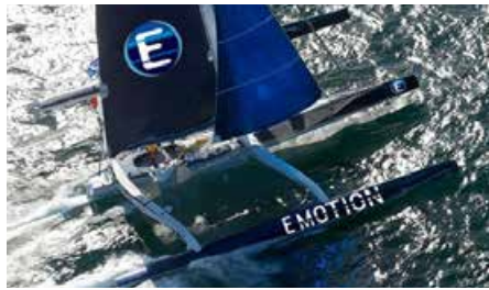
ULTIM EMOTION 23.40 m 6-12/2 West Mediterranean 35,000 €/week