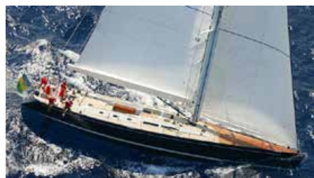
SOUTHERN STAR SWS 78 23.95m 2004 Location: Montfalcone, Italy 1,800,000 €