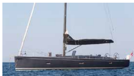
MAPOTI Sly 53 16.00 m 2008 Location: Marseille, South of France 395,000 €