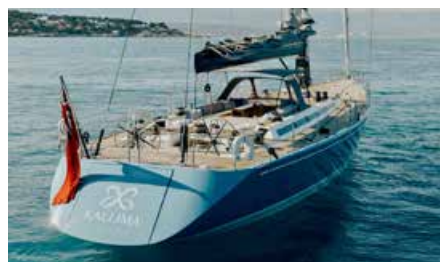
KALLIMA 24.89 m 6/3 West Mediterranean 25,000 €/week