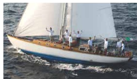
MARGILIC Wooden Classic Cutter Sloop 14.64 m 1948 Location: South of France 195,000 €