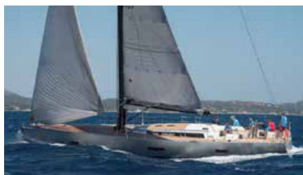
SUENO ICE 62 with 2 years warranty 18.82 m 2015 Location: Sardinia, Italy 1,099,000 €