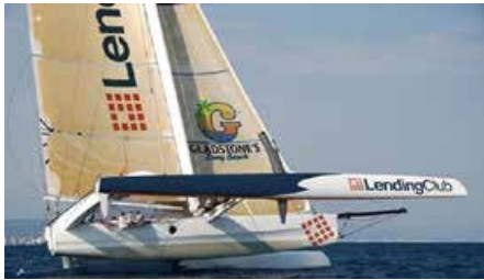
TRITIUM 72ft Ultime VPLP Design 23.38 m 2002 Location: California 495,000 US$