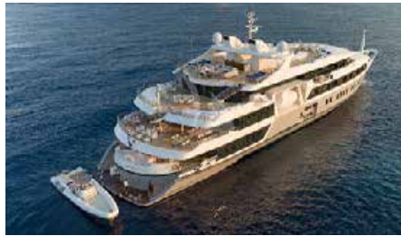
SERENITY 72.00 m 28/30 Arabian Gulf, Indian Ocean, Red Sea 550,000 €/week