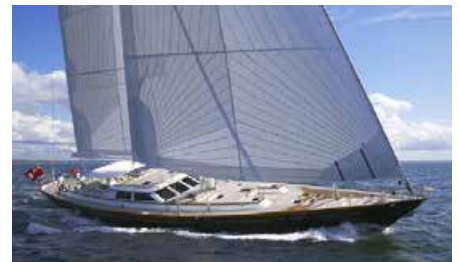
WHISPER 35.40 m 6/5 Caribbean, New England 65,000/60,000 USD/week