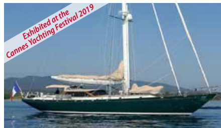
WHIRLWIND 90 ft Holland Jachtbouw 28.50 m 1998 Location: Fréjus, South of France 1,290,000 €