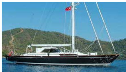
SOUTHERN CROSS Maxi 88 Sloop 29.70 m 1991/2004 Location: Croatia 700,000 €