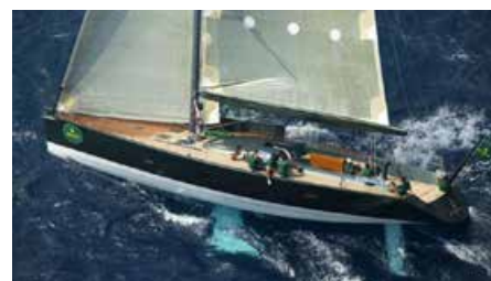
KALAO Maxi Dolphin 65 - 2 20.00 m 2003 Location: Antibes, South France 690,000 €