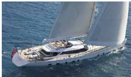
TWILIGHT 38.10 m 8/6 Caribbean 90,000/80,000 USD/week