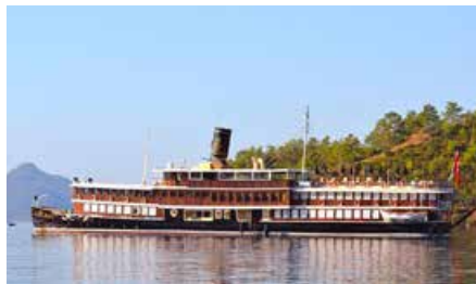
HALAS 52.00 m 24/17 Turkey 122,500/108,500 €/week