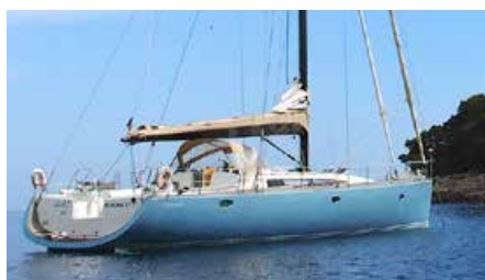
GLAZ Futuna 57 18.00 m 2006 Location: South of France 450,000 €