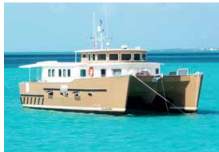
GLAZMOR Expedition Power Catamaran 18.60 m 2009 Location: Port Napoleon, South of France 590,000 €