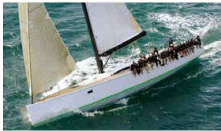
ARAGON 22.00 m 6/2 West Mediterranean 35,000 €/week