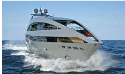
OCEAN SAPPHIRE 41.00 m 12/7 West Mediterranean 110,000/90,000 €/week