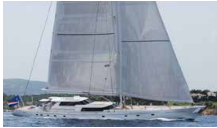
HYPERION 47.42 m 6/8 East/West Mediterranean 112,000/91,000 €/week