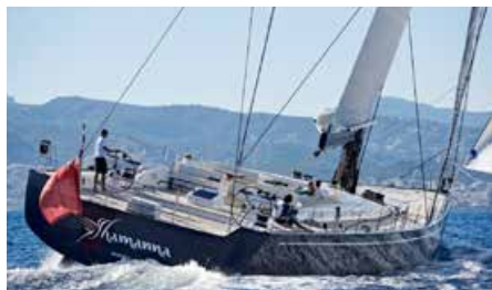
SHAMANNA 35.20 m 6/5 East/West Mediterranean 80,000 €/week