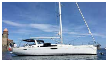
OMEGA Oceanis 60 18.24 m 2015 Location: Perpignan, South of France 499,000 €