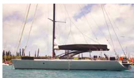
THE PEARL Farr Yacht Design Sloop 24.50 m 1996 Location: New Zealand 590,000 €