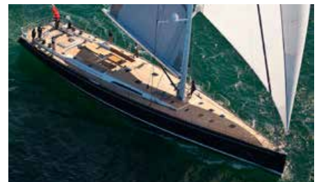
THALIMA 33.70 m 10/5 West Mediterranean 64,000/58,000 €/week