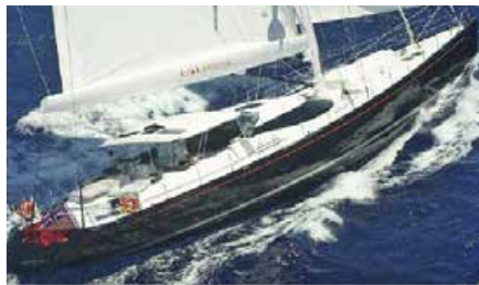
BLISS 36.70 m 10/5 Caribbean 91,000/82,000 USD/week