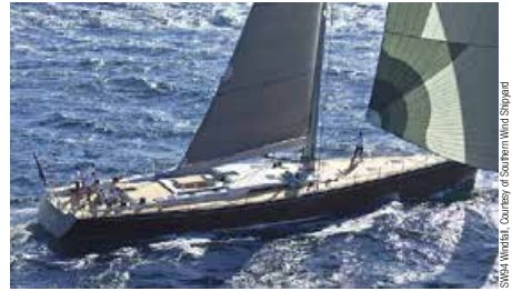
WINDFALL 28.64 m 9/4 Northern European 45,000/40,000 €/week