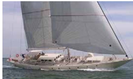
VINTAGE 27.00 m 8/3 Caribbean 19,500/17,500 €/week