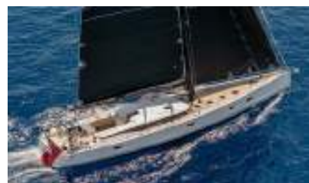
XAIRA Length: 23.17 m Guest/Crew: 6/3 Area: Caribbean / Bahamas Rate (low-high): EUR 26 900 - 29 900/week