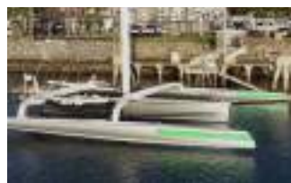
TRITIUM 72ft Ultime VPLP Design 23.38 m 2002 Location: California USD 395 000