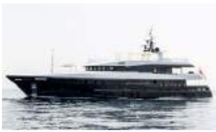
AMADEUS Length: 44.70 m Guest/Crew: 10/9 Area: Caribbean Rate (low-high): EUR 140 000 - 160 000/week