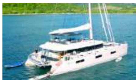
MELARNIE Length: 18.90 m Guest/Crew: 8/2 Area: Croatia Rate (low-high): EUR 24 000 - 29 500/week