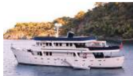
DONA DEL MARE New Classic 34.10 m 2006 Location: Croatia EUR 3 2990 000