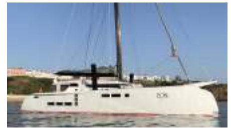
EOS TREUTLEIN 63 19.21 m 2017 Location: La Spezia, Italy EUR 1 695 000