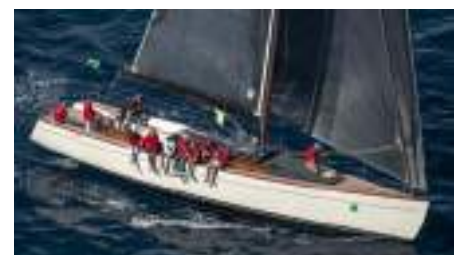
TOFINOU Tofinou 16 15.90 m 2018 (New - Sold by her Shipyard) Location: Saint-Tropez, South of France EUR 695 000