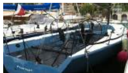
FURTIF 2 Farr 52 Performance 15.79 m 2002 Location: Toulon, South of France EUR 140 000