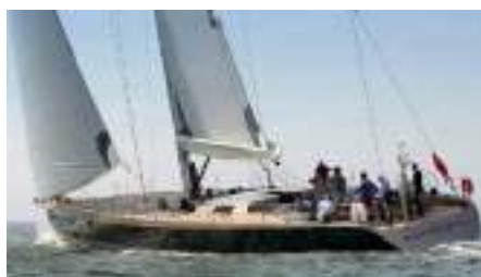
ZURBAGAN Lifting Keel Sloop 27.40 m 2006 Location: Canary Islands, Spain EUR 1 400 000