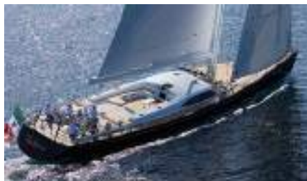
FAR & WIDE Length: 30.20 m Guest/Crew: 8/4 Area: East/West Mediterranean Rate (low-high): EUR 46 000 - 50 000/week