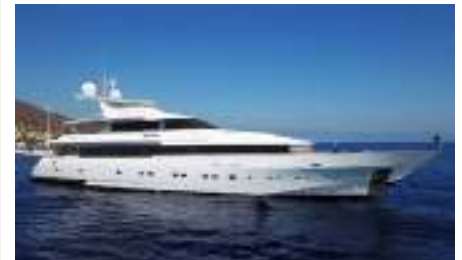
INDIGO STAR I Length: 38.00 m Guest/Crew: 10/7 Area: West/East Mediterranean Rate (low-high): EUR 78 000 - 88 000/week