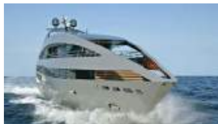
OCEAN SAPPHIRE Norman Foster Design 41.10 m 2010 Location: Cannes, South of France EUR 5 900 000