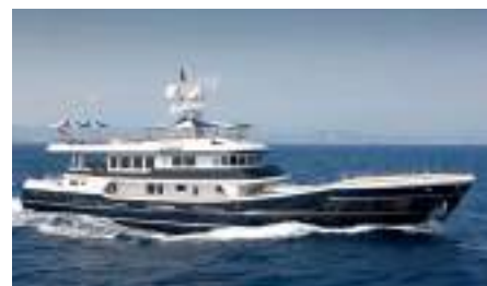
THE MERCY BOYS Length: 48.60 m Guest/Crew: 12/11 Area: West & East Mediterranean Rate (low-high): EUR 90 000 - 110 000/week