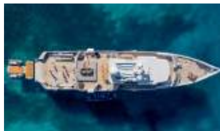
PREFERENCE 19 Length: 36.40 m Guest/Crew: 10/7 Area: West & East Mediterranean Rate (low-high): EUR 98 000 - 112 000/week