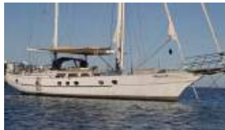
TARA BAY Scorpio 72 21.60 m 1991 Location: Marseille, South of France EUR 345 000