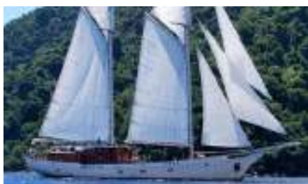
MUTIARA LAUT Length: 46.00 m Guest/Crew: 14/14 Area: Indonesia Rate (low-high): EUR 61 800 - 61 800/week