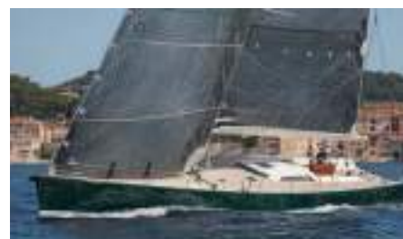
GENIE Length: 24.00 m Guest/Crew: 6/4 Area: West Mediterranean Rate (low-high): EUR 24 000/week