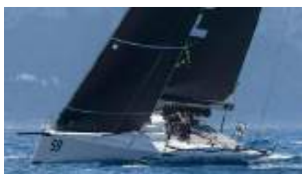
MACCHIA MEDITERRANEA TP52 15.84 m 2008 Location: Gaeta, Italy EUR 360 000