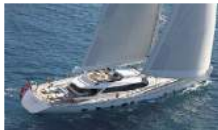
TWILIGHT Length: 38.10 m Guest/Crew: 8/6 Area: Caribbean Rate (low-high): USD 88 000 - 98 000/week