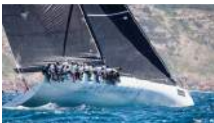
CANNONBALL Bottin Partner Maxi 72 21.90 m 2017 Location: Palma, Spain P.O.A.