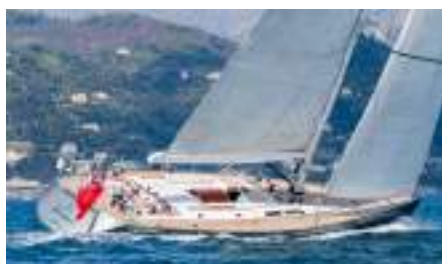
ELISE WHISPER Length: 24.00 m Guest/Crew: 8/3 Area: West Mediterranean Rate (low-high): EUR 22 500/week