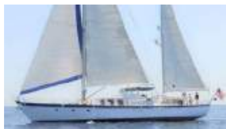
WHITE EAGLE Palmer Johnson Ketch 25.12 m 1967, Refit 2013 Location: Barcelona, Spain EUR 198 000