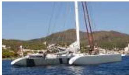
OCEAN PEARL Maxi Catamaran 33.50 m 2000 Location: Barcelona, Spain EUR 2 490 000