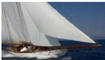
GERMANIA NOVA Classic Schooner Replica 59.79 m 2011 Location: Genova, Italy EUR 4 950 000