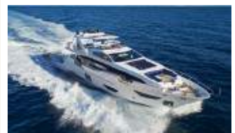
MEMORIES TOO Length: 29.10 m Guest/Crew: 12/6 Area: Greece Rate (low-high): EUR 92 000 - 97 000/week