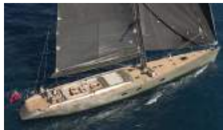
DARK SHADOW Length: 30.45 m Guest/Crew: 6/4 Area: West Mediterranean Rate (low-high): EUR 40 000 - 45 000/week