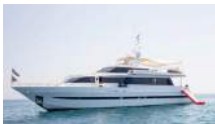
HEARTBEAT OF LIFE Heesen Yachts 28.20 m 1989, Refit 2008 Location: Barcelona, Spain EUR 1 100 000