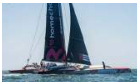
ULTIM EMOTION 2 Length: 23.40 m Guest/Crew: 8/3 Area: West Mediterranean Rate (low-high): EUR 35 000/week