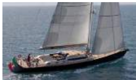
XNOI Length: 30.65 m Guest/Crew: 10/4 Area: West Mediterranean Rate (low-high): EUR 55 000 - 60 000/week