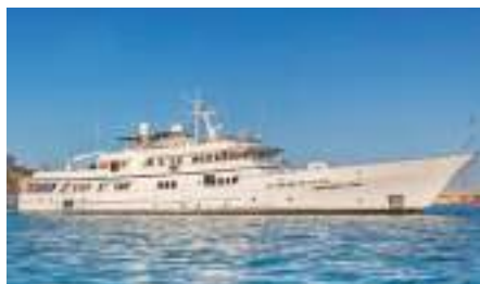
SANSSOUCI STAR Length: 53.50 m Guest/Crew: 12/8 Area: West & East Mediterranean Rate (low-high): EUR 58 000 - 58 000/week