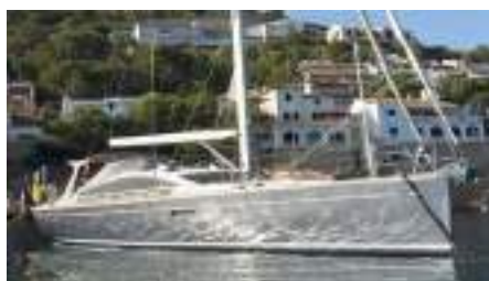
CLAIR DE LUNE Wauquiez Pilot Saloon 55 17.10 m 2014 Location: Estartit, Spain EUR 670 000