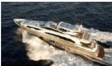
ASCENSION Length: 37.00 m Guest/Crew: 12/5 Area: West Mediterranean Rate (low-high): EUR 85 000 - 99 000/week