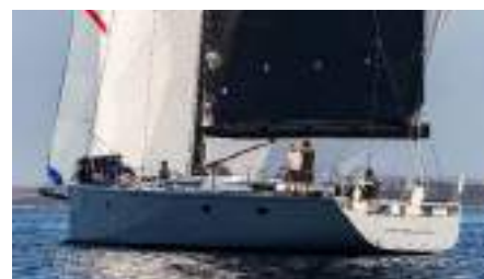
ARAGON Reichel Pugh 72 22.00 m 2006 Location: St-Tropez, France EUR 1 250 000