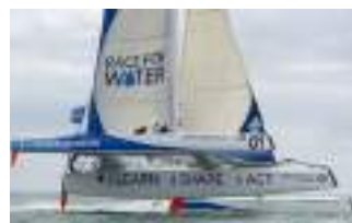
RACE FOR WATER MOD 70 21.20 m 2011 Location: Lorient, France EUR 990 000