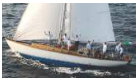
MARGILIC Wooden Classic Cutter Sloop 14.64 m 1948 Location: South of France EUR 150 000