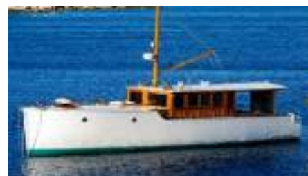
MISTY New Classic Commuter 15.3 m 2013 Location: France EUR 275 000