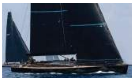
AESOP Length: 24.00 m Guest/Crew: 6/2 Area: West Mediterranean Rate (low-high): EUR 28 000 - 32 000/week