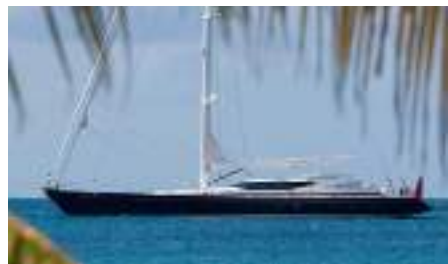
THANDEKA Length: 37.00 m Guest/Crew: 8/6 Area: Bahamas / America Rate (low-high): EUR 85 000/week