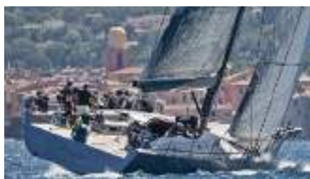
AEGIR Carbon Ocean 82 25.00 m 2011 Location: Palma, Spain EUR 2 900 000