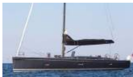
MAPOTI Sly 53 16.00 m 2008 Location: Marseille, South of France EUR 315 000