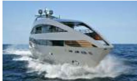
OCEAN SAPPHIRE Length: 41.00 m Guest/Crew: 12/7 Area: West Mediterranean Rate (low-high): EUR 90 000 - 110 000/week