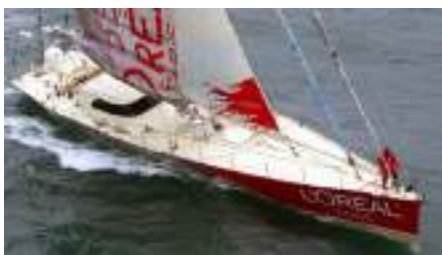
TAHIA Record Breaker Sloop 25.70 m 2001 Location: La Rochelle, France EUR 389 000