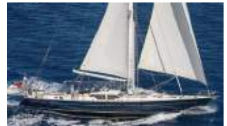
TOAD Oyster 70 21.14 m 1996, Refit 2017 Location: Imperia, Italy EUR 695 000