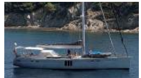
DYNASTY Hanse 630 19.80 m 2007 Loc: Port St Louis du Rhône, South of France EUR 430 000