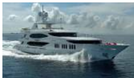
AMARULA SUN Length: 50.00 m Guest/Crew: 12/9 Area: Bahamas, Florida and Caribbean Rate (low-high): USD 175 000/week