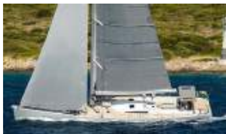
IKIGAI Length: 25.13 m Guest/Crew: 6/2 Area: Caribbean Rate (low-high): EUR 28 000 - 32 000/week