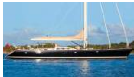
ASAHI Aluminium Sloop 31.80 m 1998, Refit 2019 Location: Genova, Italy P.O.A.