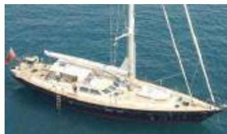
TIGA BELAS Length: 24.59 m Guest/Crew: 8/2 Area: West Mediterranean Rate (low-high): EUR 22 000 - 24 000/week