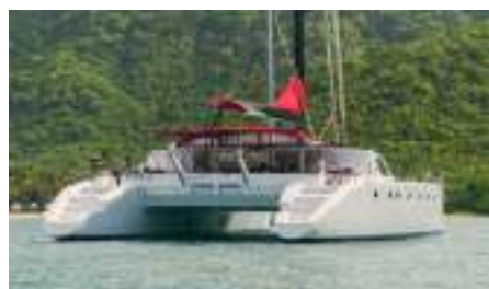
TAJ Length: 24.00 m Guest/Crew: 6/3 Area: Mediterranean Rate (low-high): EUR 27 000 - 31 000/week