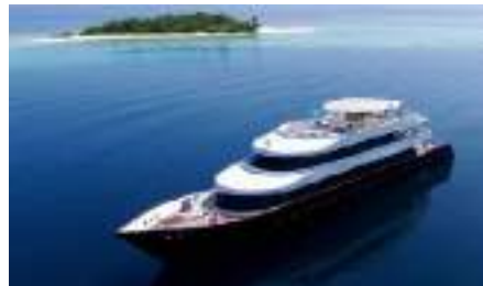
AZALEA Length: 38.75 m Guest/Crew: 18/13 Area: Maldives Rate (low-high): EUR 59 000 - 69 000/week