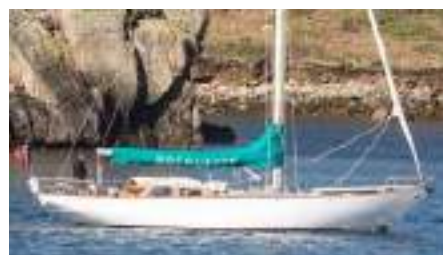
ROCQUETTE Camper and Nicholson racing sloop 12.88 m 1964, Refit 2019 Location: France, Brittany EUR 115 000