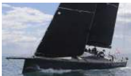
HIGH SPIRIT Botin 65 20.00 m 2015 Location: Valencia, Spain EUR 1 850 000