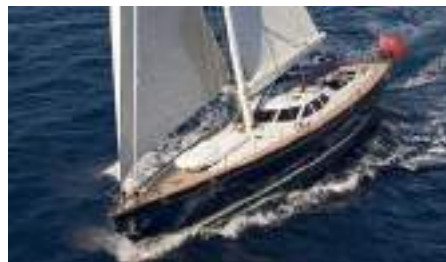
MARGARET ANN Length: 29.10 m Guest/Crew: 8/4 Area: East/West Mediterranean Rate (low-high): EUR 37 000 - 40 000/week