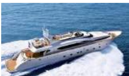
PARIS A Length: 35.00 m Guest/Crew: 12/6 Area: Greece Rate (low-high): EUR 63 000 - 73 000/week