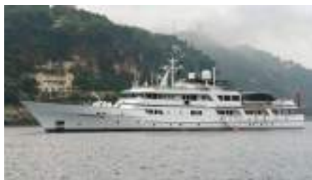
SANSSOUCI STAR Steel/Aluminium Large Motor Yacht 53.53 m 1982 Location: Copenhagen, Denmark EUR 2 900 000