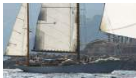
GIANNELLA II Yawl Marconi Sangermani 64 19.64 m 1966 Location: Palma, Spain EUR 750 000