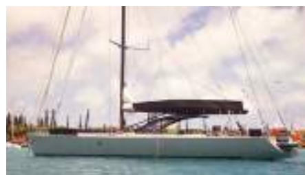
THE PEARL Farr Yacht Design Sloop 24.50 m 1996 Location: Auckland, New Zealand EUR 590 000