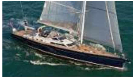
ANKA I Garcia 75 23.72 m 2009 Location: Portimao, Portugal EUR 1 095 000