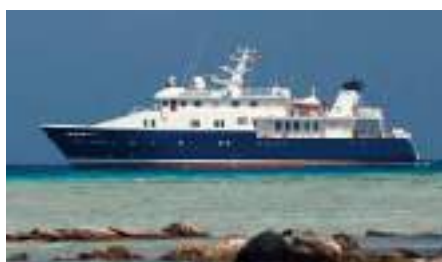
HANSE EXPLORER Length: 47.76 m Guest/Crew: 12/14 Area: Artic, North of Europe Rate (low-high): EUR 135 000 - 155 000/week