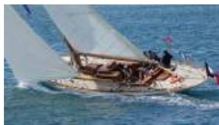
LASSE Bermudan Cutter Sloop 18.28 m 1940 Location: West Coast of France EUR 230 000