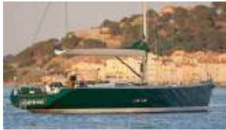
GENIE Wally 77 23.50 m 1995, Refit 2015 Location: Marseille, South of France EUR 1 190 000