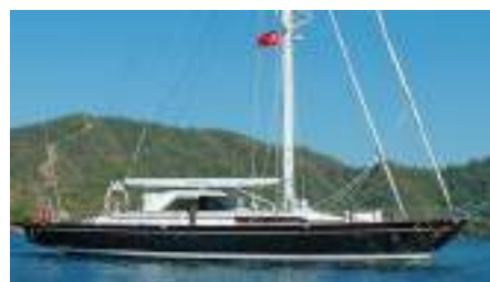
SOUTHERN CROSS Maxi 88 Sloop 26.82 m 1991, Refit 2004 Location: Croatia EUR 700 000