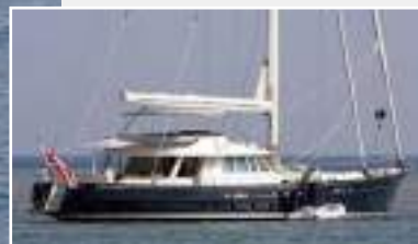
Corto Maltese, p. 11