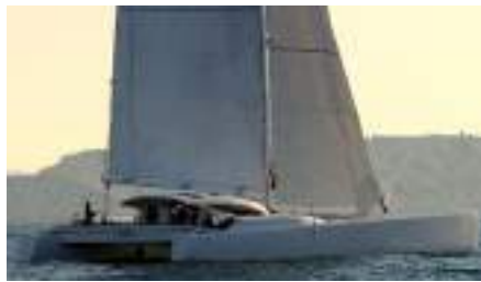
LORD DICKIE Velum 72 22.00 m 2009, Refit 2018 Location: Port Napoleon, South of France EUR 590 000