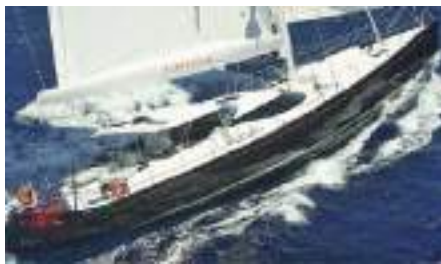
BLISS Length: 36.70 m Guest/Crew: 10/5 Area: Mediterranean Rate (low-high): USD 72 500 - 80 000/week