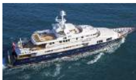
BLU 470 Length: 49.68 m Guest/Crew: 10/11 Area: Mediterranean Rate (low-high): EUR 185 000 - 210 000/week