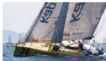
AUSTRIA ONE Ex Imoca 60 18.28 m 1995/2012 Location: Split, Croatia EUR 195 000