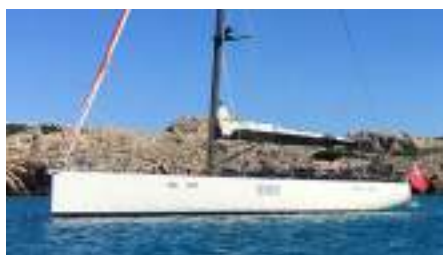
TUSCAN SPIRIT HANSE 630e 19.00 m 2014 Location: Near Pisa, Italy EUR 790 000