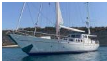
PROVENANCE Wooden Ketch 28.65 m 1968, Refit 2018 Location: Malta EUR 3 950 000