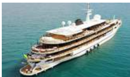
CHAKRA Length: 86.00 m Guest/Crew: 24/30 Area: Middle East / Arabia Rate (low-high): EUR 495 000 - 495 000/week