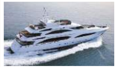
DIANE Length: 43.00 m Guest/Crew: 10/8 Area: Spain, Balearic Islands Rate (low-high): EUR 135 000 - 150 000/week