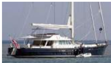
CORTO MALTESE Oceangoing Sloop 37.00 m 1982, Refit 2006 Location: Cannes, South of France EUR 6 200 000