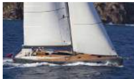
AEGIR Length: 25.10 m Guest/Crew: 7/3 Area: West Mediterranean Rate (low-high): EUR 28 000 - 32 000/week