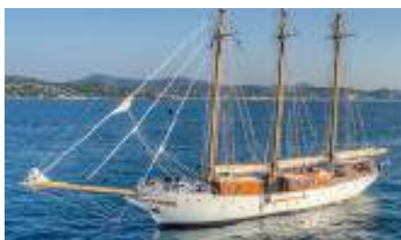
TRINAKRIA Length: 49.06 m Guest/Crew: 10/8 Area: West Mediterranean Rate (low-high): EUR 65 000 - 75 000/week