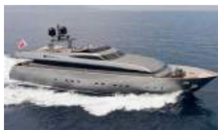
IROCK Length: 34.00 m Guest/Crew: 11/6 Area: West Mediterranean Rate (low-high): EUR 84 000 - 96 000/week