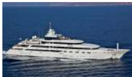
TITANIA Length: 73.00 m Guest/Crew: 12/21 Area: Caribbean/Bahamas Rate (low-high): USD 540 000 - 650 000/week