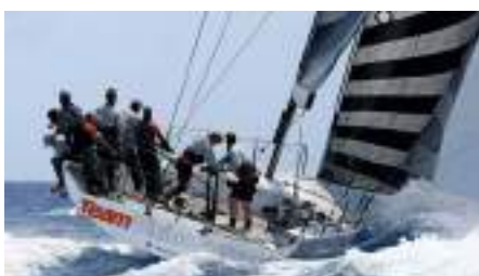
TEAM VISION FUTURE TP52 15.84 m 2015/2020 Location: Le Lavandou, France EUR 850 000