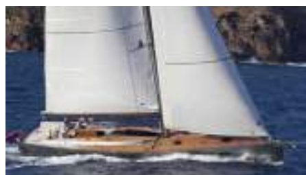
AEGIR Carbon Ocean 82 25.00 m 2011 Location: Palma, Spain EUR 2 900 000