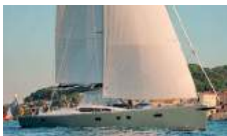
ICTHUS Length: 21.75 m Guest/Crew: 6/2 Area: West Mediterranean Rate (low-high): EUR 15 000 - 16 000/week