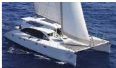
FRIENDS FOREVER DH 550 16.75 m 2016 Location: Valencia, Spain EUR 745 000