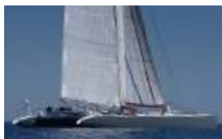
OCEAN PEARL Maxi Catamaran 33.50 m 2000 Location: Barcelona, Spain EUR 2 450 000