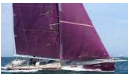
GLOBE Ex Imoca 60 18.28 m 1992 Location: Gdansk, Poland EUR 115 000