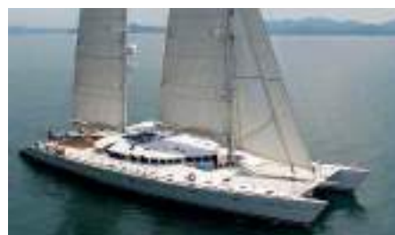
DOUCE FRANCE Length: 42.20 m Guest/Crew: 12/7 Area: Auckland / New Zealand Rate (low-high): EUR 95 000 - 150 000/week