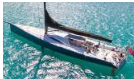
LEOPARD Length: 30.50 m Guest/Crew: 8/5 Area: Caribbean Rate (low-high): EUR 48 000/week