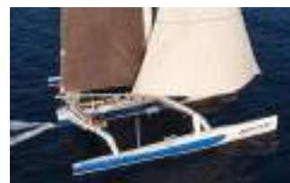
AKRON AOTON Orma 60 18.28 m 1998 Location: Greece EUR 259 000