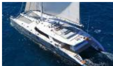
CHE Length: 34.70 m Guest/Crew: 8/6 Area: Caribbean Rate (low-high): USD 85 000 - 95 000/week