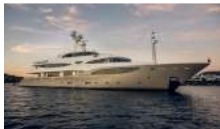
LIGHT HOLIC Length: 60.00 m Guest/Crew: 12/15 Area: Caribbean/Bahamas Rate (low-high): EUR 320 000 - 360 000/week