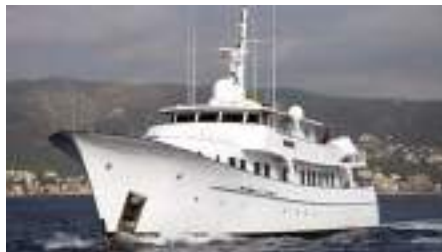
KRISS Abeking & Rasmussen Built 45.00 m 1974, Refit 2017 Location: Malta EUR 6 000 000