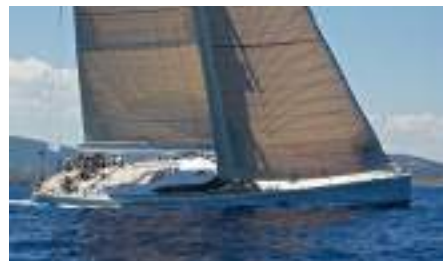
FAREWELL Length: 30.20 m Guest/Crew: 9/5 Area: West Mediterranean Rate (low-high): EUR 42 000 - 46 000/week