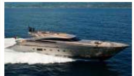
MUSA Length: 36.20 m Guest/Crew: 9/5 Area: West Mediterranean Rate (low-high): EUR 75 000 - 80 000/week