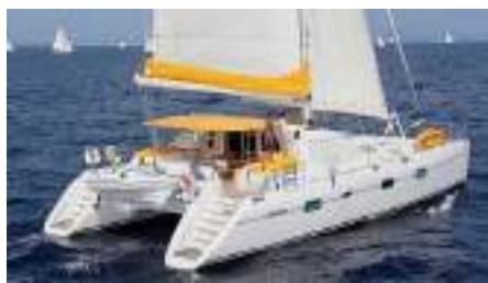
TAHUATA Privilege 585 17.60 m 2005/2013 Location: Sète, South of France EUR 550 000