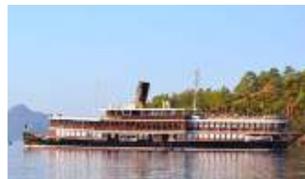
HALAS Length: 52.00 m Guest/Crew: 24/17 Area: Turkey Rate (low-high): EUR 126 000 - 145 000/week