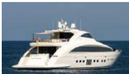
IL GATTOPARDO Amer 116 S 36.00 m 2012 Location: Barcelona, Spain P.O.A.