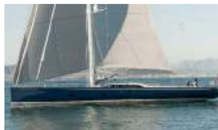
FARFALLA Length: 31.78 m Guest/Crew: 8/5 Area: West Mediterranean Rate (low-high): EUR 65 000/week