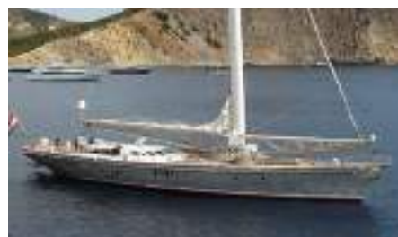
DWINGER Length: 48.50 m Guest/Crew: 11/7 Area: Northern Europe Rate (low-high): EUR 70 000 - 75 000/week