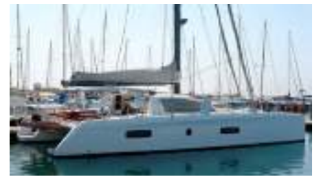
MOANA Outremer 5X 18.28 m 2012 Location: Port Camargue, South of France EUR 1 095 000