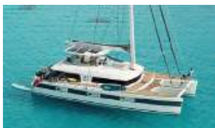
OCEAN VIEW Length: 18.90 m Guest/Crew: 6/2 Area: Balearics Rate (low-high): EUR 20 000 - 22 500/week