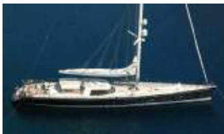
VAIMITI Length: 39.20 m Guest/Crew: 8/5 Area: Caribbean Rate (low-high): USD 63 000 - 72 000/week