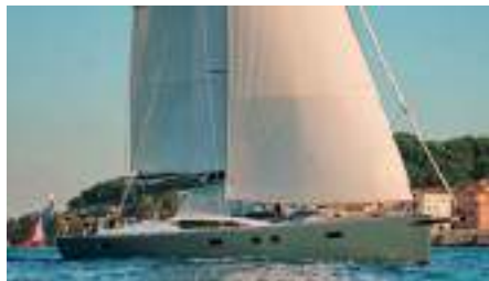
ICTUS Futuna 70 21.75 m 2010 Location: Marseille, South of France EUR 1 350 000