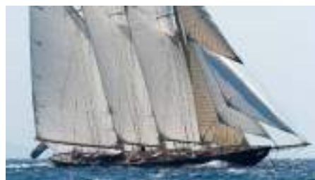
ATLANTIC New Classic Schooner Replika 64.50 m 2010 Location: La Seyne sur Mer, South of France P.O.A.