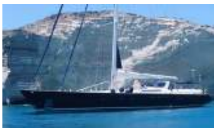
AMADEUS Length: 33.50 m Guest/Crew: 12/6 Area: Greece Rate (low-high): EUR 35 000 - 45 500/week