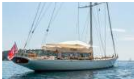
WHITEFIN Length: 27.43 m Guest/Crew: 8/4 Area: West Mediterranean Rate (low-high): EUR 25 500 - 28 500/week