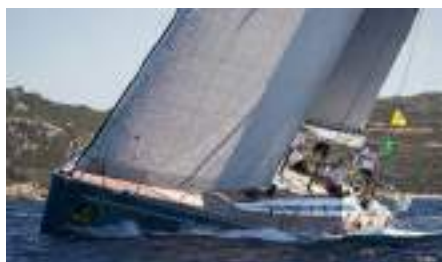
KALLIMA Length: 24.89 m Guest/Crew: 6/3 Area: Caribbean Rate (low-high): EUR 28 000 - 28 000/week