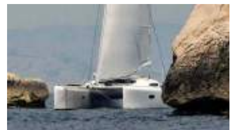
PAMPERO TS 52.8 16.10 m 2011 Location: Marseille, South of France EUR 560 000