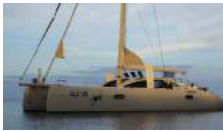
SILLY CAT ICE CAT 61 18.60 m 2018 Location: Sète, South of France EUR 1 290 000