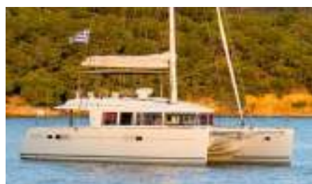
GOLDEN PEARL Length: 17.07 m Guest/Crew: 8/2 Area: Greece Rate (low-high): EUR 14 850 - 20 250/week