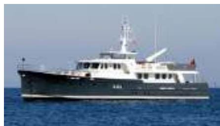
ALEXANDRIA Commuter 108 32.50 m 2013 Location: Barcelona, Spain EUR 1 900 000