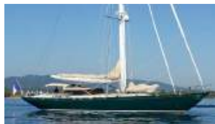
WHIRLWIND 90 th Holland Jachtbouw 28.50 m 1998 Location: Fréjus, South of France EUR 990 000