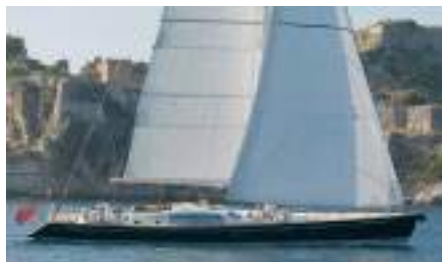
GRAND BLEU VINTAGE Length: 29.00 m Guest/Crew: 8/4 Area: East & West Mediterranean Rate (low-high): EUR 39 000 - 43 000/week