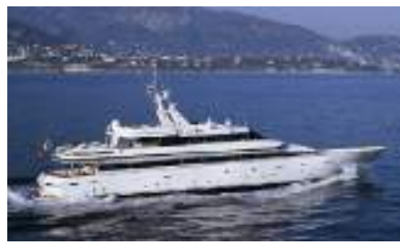
COSTA MAGNA Length: 44.50 m Guest/Crew: 10/8 Area: West Mediterranean Rate (low-high): EUR 90 000 - 96 000/week