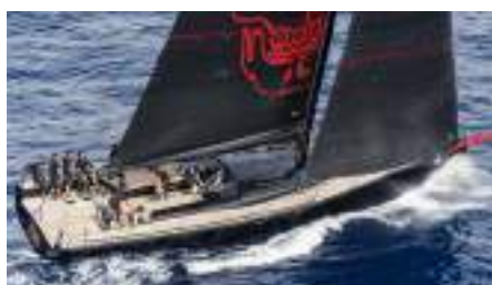
BLACK LEGEND S Mylius Cruiser-racer 18.23 m 2013 Location: Monaco EUR 1 250 000