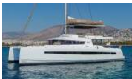
LICENSE TO CHILL Length: 16.80 m Guest/Crew: 6/2 Area: Caribbean Rate (low-high): EUR 18 800 - 27 300/week