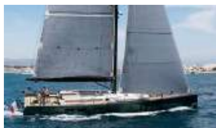
SHAMLOR Length: 22.40 m Guest/Crew: 6/2 Area: West Mediterranean Rate (low-high): EUR 15 000 - 16 000/week