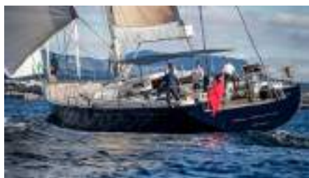
BLUE DIAMOND Bermudian Sloop 30.00 m 2004 Location: Palma, Spain EUR 2 200 000