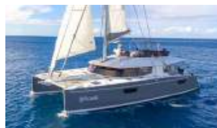
ARAOK Length: 17.80 m Guest/Crew: 8/2 Area: Caribbean Rate (low-high): EUR 24 000 - 28 000/week