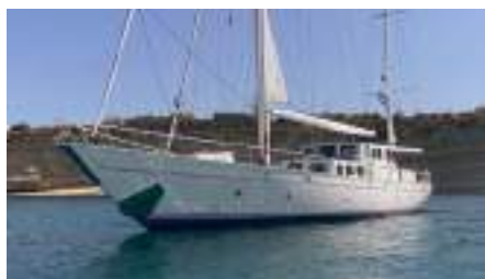
PROVENANCE Cold Moulded Ketch 29.65 m 1968, Refit 2019 Location: Malta EUR 3 950 000