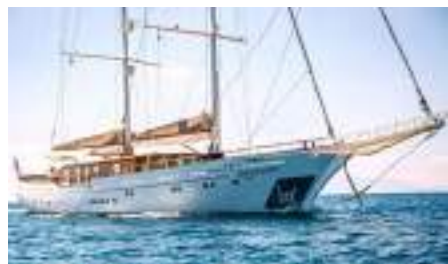
ZANZIBA Length: 40.00 m Guest/Crew: 10/7 Area: East Mediterranean Rate (low-high): EUR 69 300 - 73 500/week