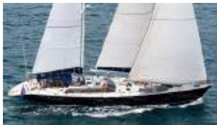
ENTHALPIA Garcia Aluminium Ketch 21.60m 1992, Refit 2015 Location: Marseille, South of France EUR 550 000