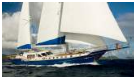
QUEEN SOUTH III Oceangoing Ketch 35.97 m 1999, Refit 2013 Location: Caribbean EUR 750 000