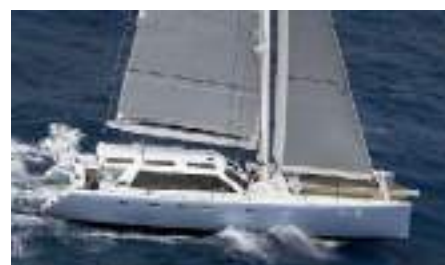
SLIM Length: 20.12 m Guest/Crew: 6/2 Area: Caribbean Rate (low-high): USD 38 400/week