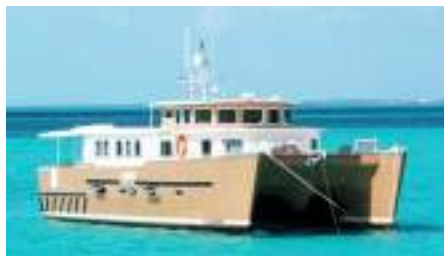
GLAZMOR Expedition Power Catamaran 18.60 m 2009 Location: Port Napoleon, South of France EUR 490 000