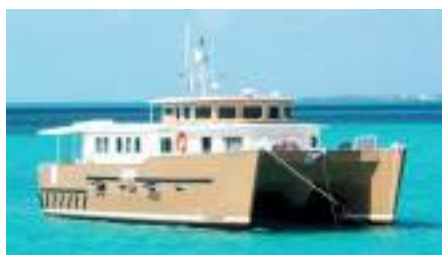
GLAZMOR Expedition Power Catamaran 18.60 m 2009 Location: Port Napoleon, South of France EUR 490 000