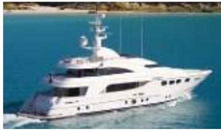
DE LISLE III Length: 42.00 m Guest/Crew: 9/7 Area: Australia Rate (low-high): USD 125 000/week