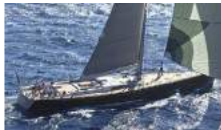
ARAGON Length: 28.64 m Guest/Crew: 9/4 Area: West Mediterranean Rate (low-high): EUR 40 000 - 45 000/week