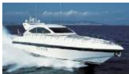
HALKIN Mangusta 72 21.56 m 1999 Location: Alassio, Italy EUR 490 000