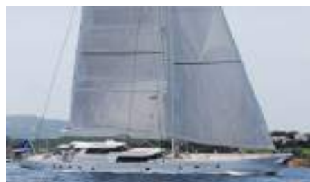
HYPERION Length: 47.42 m Guest/Crew: 6/8 Area: Northern Europe Rate (low-high): EUR 91 000 - 112 000/week