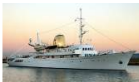
CHRISTINA O Length: 99.13 m Guest/Crew: 34/38 Area: Caribbean/Bahamas Rate (low-high): EUR 560 000 - 630 000/week