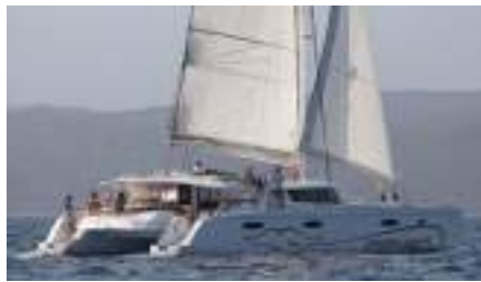
MOBY DICK Galathea 65 19.81 m 2009 Location: Bastia, Corsica EUR 950 000