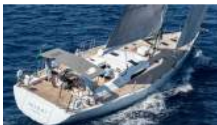
IKIGAI JFA 82 Sloop 25.13 m 2001, Refit 2018 Location: Palma, Spain P.O.A.