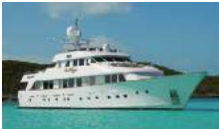
SWEET ESCAPE Length: 39.62 m Guest/Crew: 12/8 Area: Bahamas Rate (low-high): USD 125 000/week