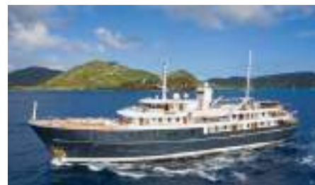
SHERAKHAN Length: 69.65 m Guest/Crew: 26/19 Area: Caribbean/America Rate (low-high): EUR 425 000/week