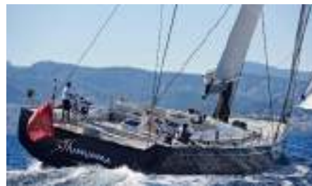
SHAMANNA Length: 35.20 m Guest/Crew: 8/6 Area: Caribbean Rate (low-high): USD 90 000 - 105 000/week