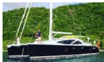
CURANTA CRIDHE Length: 15.30 m Guest/Crew: 6/2 Area: West Mediterranean Rate (low-high): EUR 15 000 - 16 000/week