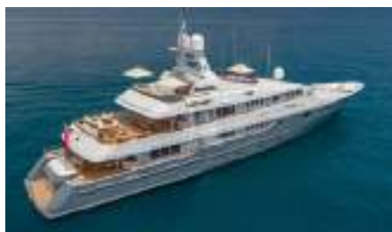
MOSAIQUE Length: 49.90 m Guest/Crew: 12/12 Area: Caribbean Rate (low-high): USD 160 000 - 180 000/week