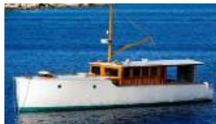
MISTY New Classic Commuter 15.3 m 2013 Location: France EUR 275 000