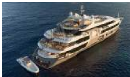
SERENITY Length: 72.00 m Guest/Crew: 28/30 Area: Middle East/Asia Rate (low-high): EUR 550 000/week