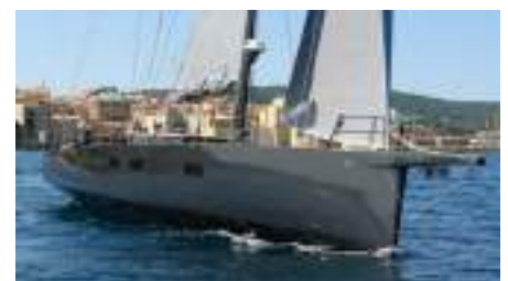
BLACK LEGEND 4 Black Pepper Code 2.1 17.40 m 2019 (New - Sold by her Shipyard) Location: Port Grimaud, South of France EUR 2 050 000