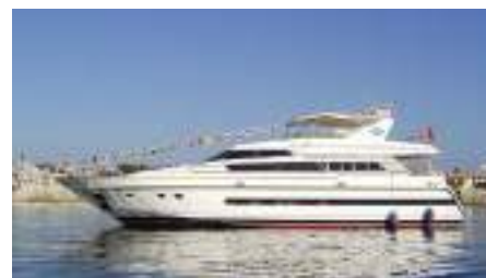
ABOU MAYA Monte Fino 83 25.29 m 1994 Location: Morocco EUR 290 000