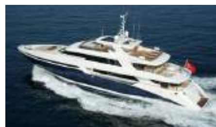
TATIANA Length: 44.90 m Guest/Crew: 12/9 Area: West Mediterranean Rate (low-high): EUR 150 000 - 165 000/week