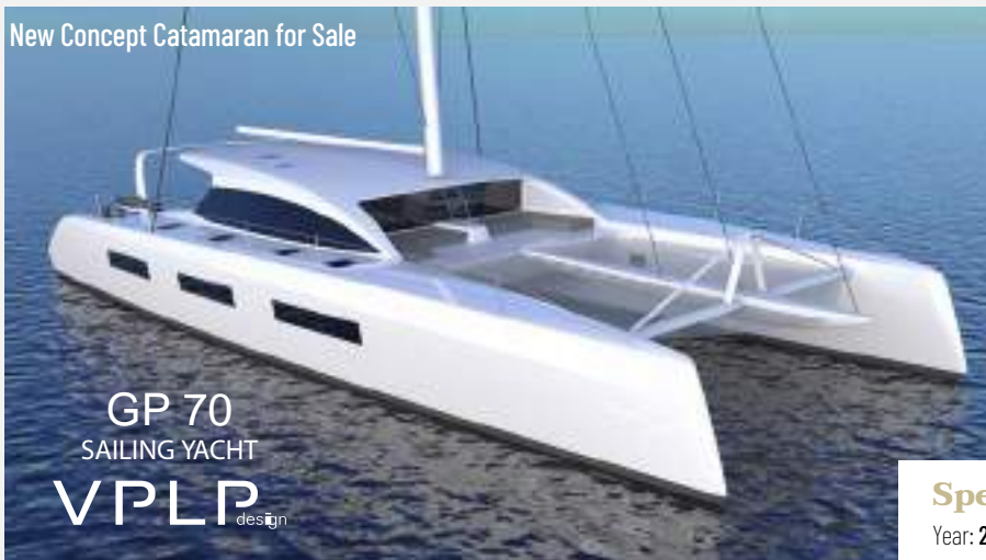
New Concept Catamaran for Sale