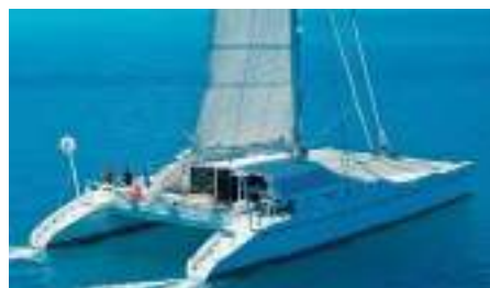
MAGIC CAT Length: 25.00 m Guest/Crew: 8/4 Area: Caribbean Rate (low-high): EUR 35 000/week