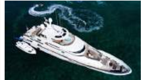
PIPE DREAM Length: 39.62 m Guest/Crew: 10/7 Area: Florida / Bahamas Rate (low-high): USD 140 000/week