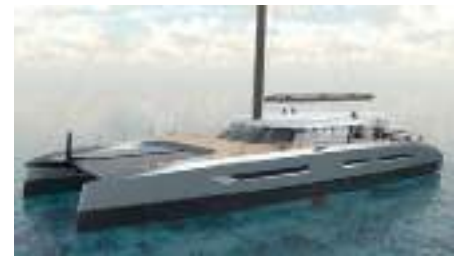
ICECAT seventytwo Cruising catamaran 22.00 m 2020 Location: Italy P.O.A.