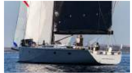
ARAGON Reichel Pugh 72 22.00 m 2006 Location: Palma, Spain EUR 1 250 000