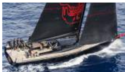
BLACK LEGEND S Mylius Cruiser-racer 18.23 m 2013 Location: Monaco EUR 1 250 000