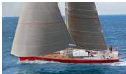
NOMAD IV Length: 30.48 m Guest/Crew: 12/4 Area: French Polynesia Rate (low-high): EUR 56 000/week