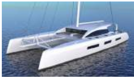
GP 70 GP 70 21.00 m 2018 Location: Portugal P.O.A.