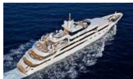
O'MEGA Length: 82.50 m Guest/Crew: 30/28 Area: Bahamas Rate (low-high): EUR 550 000/week