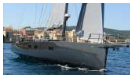
BLACK LEGEND 4 Black Pepper Code 2.1 17.40 m 2019 (New - Sold by her Shipyard) Location: Port Grimaud, France EUR 2 050 000