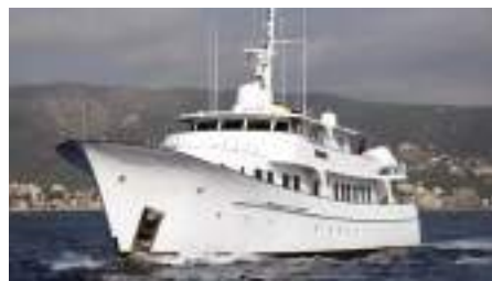
KRIISS Abeking & Rasmussen Built 45.00 m 1974, Refit 2017 Location: Malta EUR 6 000 000