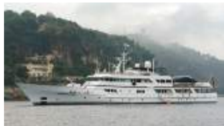
SANSSOUCI STAR Steel/Aluminium Large Motor Yacht 53.53 m 1982 Location: Copenhagen, Denmark EUR 2 900 000