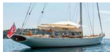
WHITEFIN Renaissance Yachts 27.43 m 1983, Refit 2020 Location: Italy P.O.A.