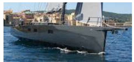
BLACK LEGEND 4 Black Pepper Code 2.1 17.40 m 2019 (New - Sold by her Shipyard) Location: Port Grimaud, South of France EUR 1 695 000