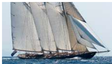
ATLANTIC New Classic Schooner Repliqua 64.50 m 2010 Location: Italy P.O.A.