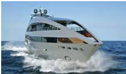
OCEAN SAPPHIRE Length: 41.00 m Guest/Crew: 12/7 Area: West Mediterranean Rate: From EUR 90 000/week