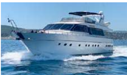
GENIUS Length: 21.70 m Guest/Crew: 7/2 Area: West Mediterranean Rate: From EUR 21 000/week