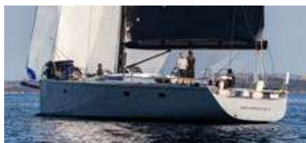
ARAGON Reichel Pugh 72 22.00 m 2006 Location: St-Tropez, France EUR 992 000