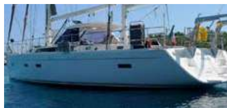
MY WAY Amel 55 17.33 m 2013 Location: France, Royan EUR 715 000