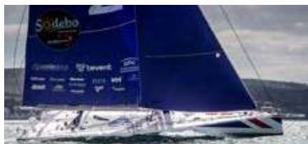
SUPERBIGOU Imoca 60 ex Medallia 18.28 m 2000/2020 Location: Caen, France EUR 290 000