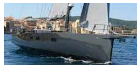
BLACK LEGEND 4 Black Pepper Code 2.1 17.40 m 2019 (New - Sold by her Shipyard) Location: Port Grimaud, France EUR 1 695 000