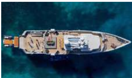
PREFERENCE 19 Length: 36.40 m Guest/Crew: 10/7 Area: West Mediterranean Rate: From EUR 98 000/week