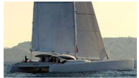
LORD DICKIE Velum 72 22.00 m 2009, Refit 2018 Location: Canet en Roussillon, South of France EUR 490 000