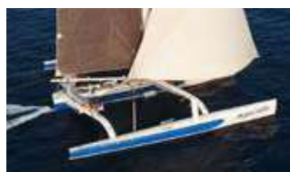
AKRON AOTON Orma 60 18.28 m 1998 Location: Greece From EUR 259 000