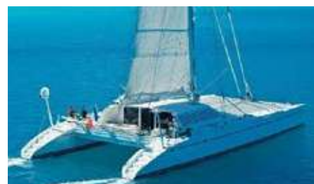
MAGIC CAT Length: 25.00 m Guest/Crew: 8/4 Area: West Mediterranean Rate: From EUR 35 000/week