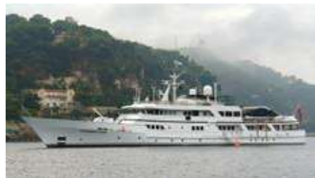
SANSSOUCI STAR Steel/Aluminium Large Motor Yacht 53.53 m 1982 Location: Copenhagen, Denmark EUR 2 900 000