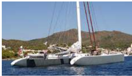
OCEAN PEARL Maxi Catamaran 33.50 m 2000 Location: Barcelona, Spain EUR 1 950 000