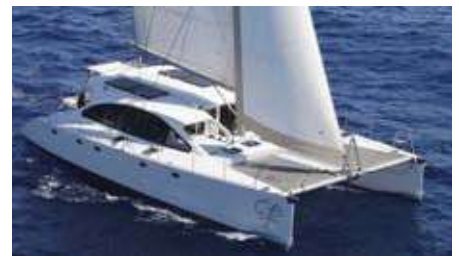
FRIENDS FOREVER DH 550 16.75 m 2016 Location: Portimao, Portugal EUR 665 000