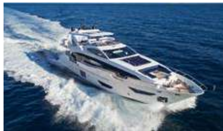
MEMORIES TOO Length: 29.10 m Guest/Crew: 12/6 Area: Greece, Turkey Rate: From EUR 92 000/week