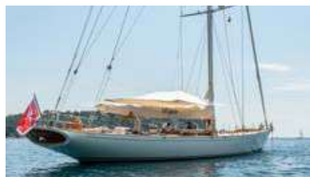
WHITEFIN Renaissance Yachts 27.43 m 1983, Refit 2020 Location: Italy P.O.A.