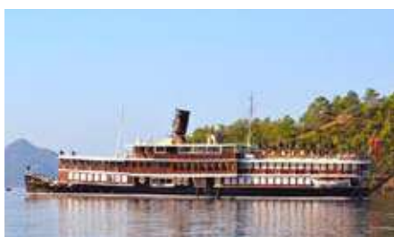
HALAS Length: 52.00 m Guest/Crew: 24/16 Area: Turkey Rate: From EUR 140 000/week