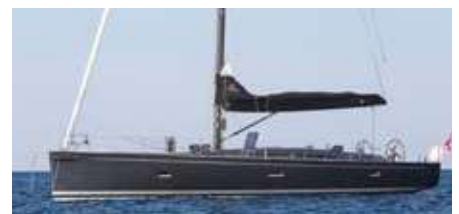
MAPOTI Sly 53 16.00 m 2008 Location: Marseille, South of France EUR 285 000