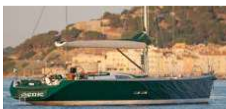
GENIE Wally 77 23.50 m 1995, Refit 2015 Location: Marseille, South of France P.O.A.