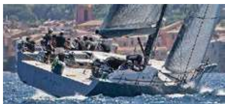
AEGIR Carbon Ocean 82 25.00 m 2011 Location: Palma, Spain EUR 2 900 000