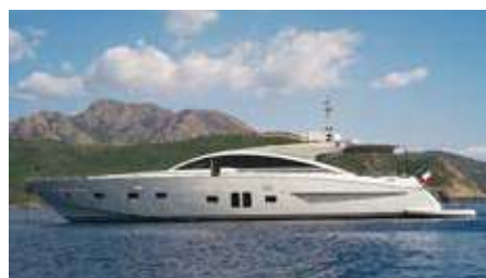
NOE Guy Couach 2800 Open 28.60 m 2013 Location: France, Saint Mandrier EUR 3 900 000