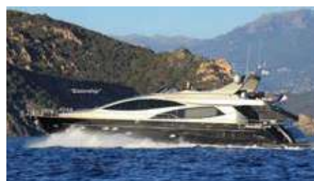
4 FIVE Riva Opera 85 26.02 m 2005 Location: Spain, Roses EUR 1 320 000