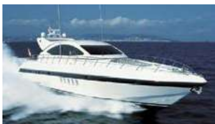
HALKIN Mangusta 72 21.56 m 1999 Location: Alassio, Italy EUR 430 000