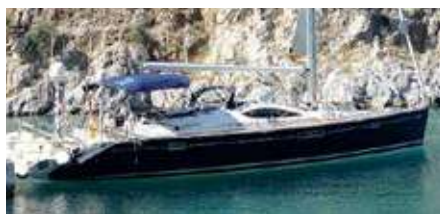
FOXY Sun Odyssey 54 DS 16.75 m 2007 Location: Greece, Kilada EUR 250 000