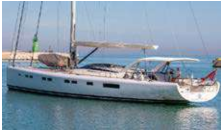
NAKUPENDA Length: 24.00 m Guest/Crew: 8/3 Area: West Mediterranean Rate: From EUR 28 000/week