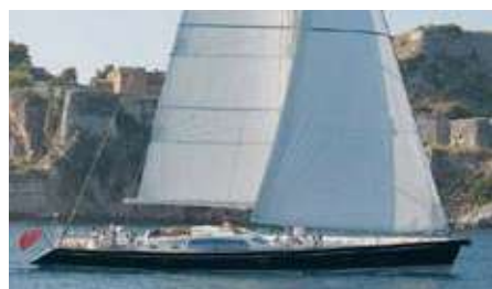
GRAND BLEU VINTAGE Length: 29.00 m Guest/Crew: 8/4 Area: West Mediterranean Rate: From EUR 39 000/week