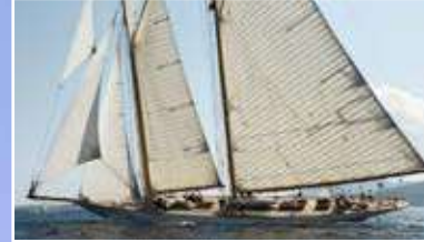
Eleonora, page 9