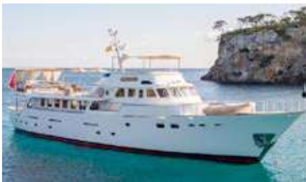
ODYSSEY III Length: 33.00 m Guest/Crew: 8/6 Area: West Mediterranean Rate: From EUR 54 000/week