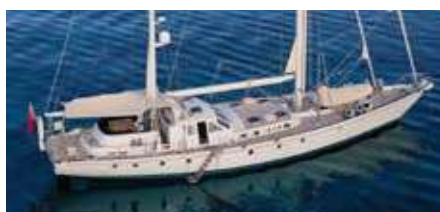
ACOA 92ft Ed Dubois Ketch 28.00 m 1985 Location: Propriano, Corsica EUR 1 190 000