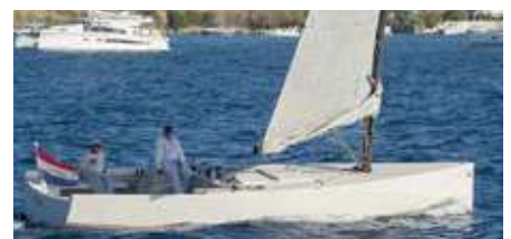
FRESET Setton 32 Custom 9.76 m 2012 Location: France, Antibes EUR 345 000