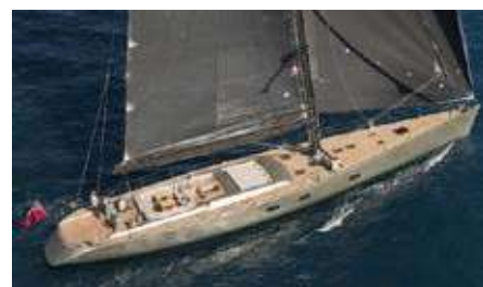
DARK SHADOW Length: 30.45 m Guest/Crew: 6/4 Area: West Mediterranean Rate: From EUR 40 000/week