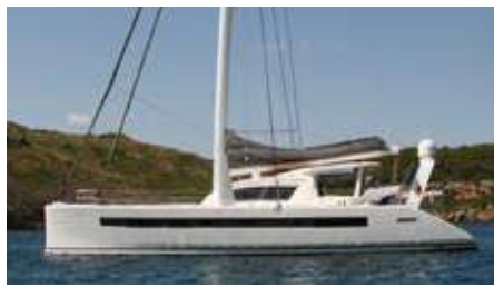
TRAMONTANE Catana 65 19.70 m 2008, Refit 2021 Location: Gruissan, South of France EUR 1 350 000