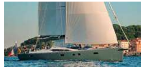
ICHTUS Futuna 70 21.75 m 2010 Location: Marseille, South of France EUR 1 215 000