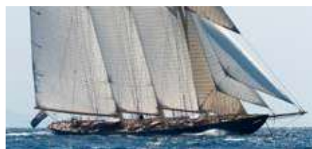
ATLANTIC New Classic Schooner Repliqua 64.50 m 2010 Location: La Seyne sur Mer, South of France P.O.A.