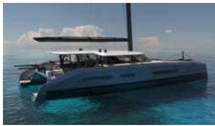
ICECAT sixtyfour Cruising catamaran 19.50 m 2022 Location: Italy P.O.A.