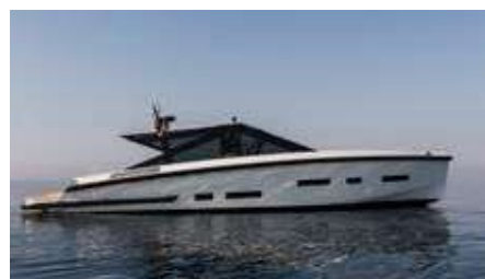
TYM Wallypower 58 17.66 m 2010, Refit 2020 Location: Croatia, Rovinj EUR 1 100 000