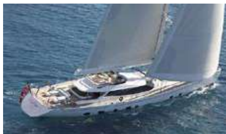
TWILIGHT Length: 38.10 m Guest/Crew: 8/6 Area: East Mediterranean Rate: From EUR 88 000/week