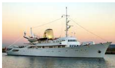
CHRISTINA O Length: 99.13 m Guest/Crew: 34/38 Area: West Mediterranean Rate: From EUR 560 000/week