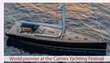
World premier at the Cannes Yachting Festival