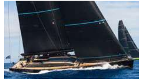
AESOP Length: 23.99 m Guest/Crew: 4/2 Area: West Mediterranean Rate: From EUR 30 000/week