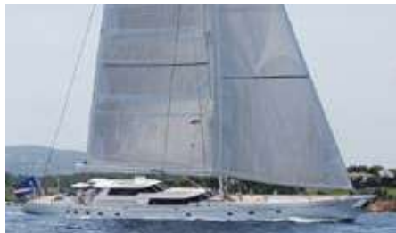
HYPERION Length: 47.42 m Guest/Crew: 6/8 Area: Northern Europe Rate: From EUR 91 000/week