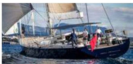
BLUE DIAMOND Bermudian Sloop 30.00 m 2004, Refit 2021 Location: Palma, Spain EUR 1 950 000