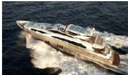
ASCENSION Length: 37.00 m Guest/Crew: 12/5 Area: West Mediterranean Rate: From EUR 85 000/week