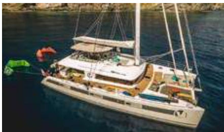
OCEAN VIEW Length: 18.90 m Guest/Crew: 6/2 Area: West Mediterranean Rate: From EUR 20 000/week