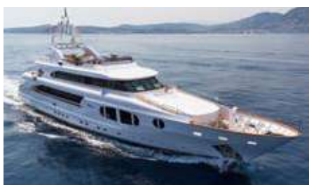
BINA Length: 43.25 m Guest/Crew: 12/9 Area: West Mediterranean Rate: From EUR 150 000/week