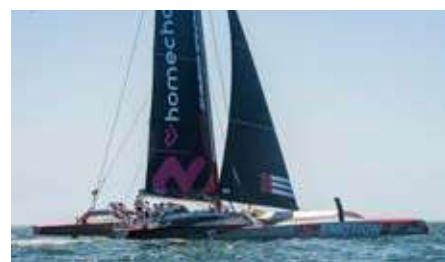
ULTIM EMOTION 2 Length: 24.38 m Guest/Crew: 8/3 Area: West Mediterranean Rate: From EUR 35 000/week