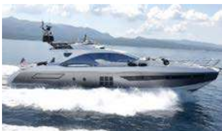
MAKANI Length: 23.60 m Guest/Crew: 9/4 Area: Greece Rate: From EUR 36 000/week