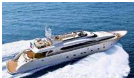
PARIS A Length: 35.00 m Guest/Crew: 12/6 Area: Greece Rate: From EUR 63 000/week