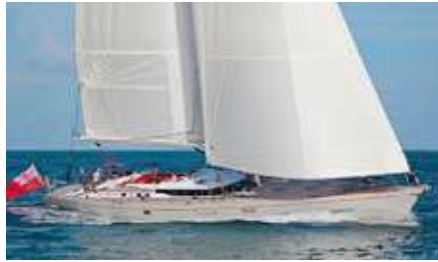
SWALLOWS AND AMAZONS Length: 23.70 m Guest/Crew: 8/3 Area: Caribbean Rate: From EUR 20 000/week