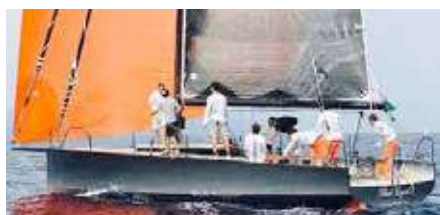
BLACK LEGEND 2 Black Pepper Code 1 12.00 m 2013 Location: France, Port Grimaud EUR 345 000