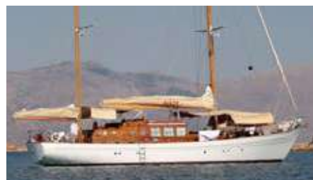
AITOR Laurent Gilles Ketch 21.75 m 1964, Refit 2017 Location: Sète, France EUR 460 000