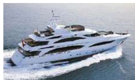
DIANE Length: 43.00 m Guest/Crew: 10/8 Area: West Mediterranean Rate: From EUR 135 000/week