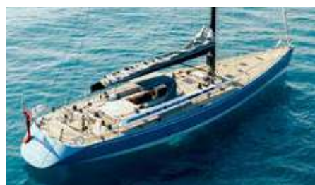
KALLIMA Length: 24.89 m Guest/Crew: 8/3 Area: West Mediterranean Rate: From EUR 28 000/week