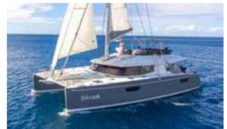
ARAOK Length: 17.80 m Guest/Crew: 6/2 Area: West Mediterranean Rate: From EUR 24 000/week