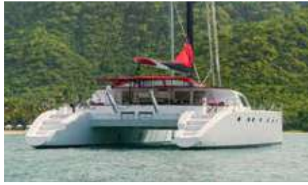
TAJ Length: 24.00 m Guest/Crew: 6/3 Area: Caribbean Rate: From EUR 27 000/week