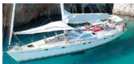
WANAKA Farr 525 15.97 m 2005 Location: Greece, Near Hydra Island EUR 330 000