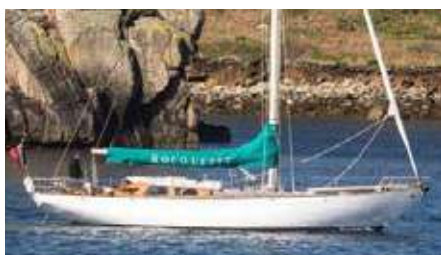
ROCQUETTE Camper and Nicholson racing sloop 12.88 m 1964, Refit 2019 Location: France, Brittany EUR 115 000