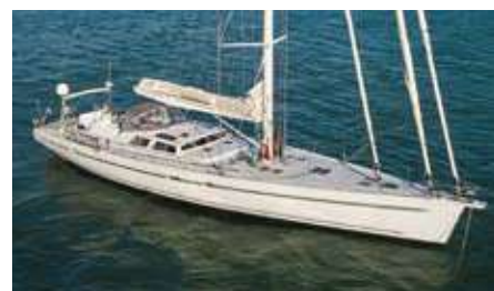
FANI Length: 26.33 m Guest/Crew: 12/2 Area: Caribbean Rate: From EUR 22 000/week