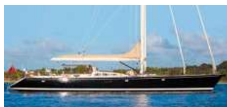
ASAHI Aluminium Sloop 31.80 m 1998, Refit 2019 Location: Genova, Italy EUR 2 450 000