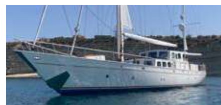
PROVENANCE Cold Moulded Ketch 29.65 m 1968, Refit 2019 Location: Palma EUR 1 000 000