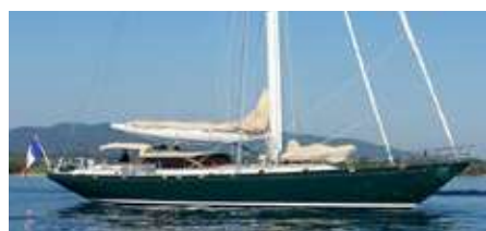
WHIRLWIND 90ft Holland Jachtbouw 28.50 m 1998 Location: Port Camargue, France EUR 875 000