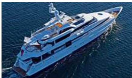
LIFE SAGA Length: 42.10 m Guest/Crew: 12/8 Area: Caribbean Rate: From EUR 110 000/week