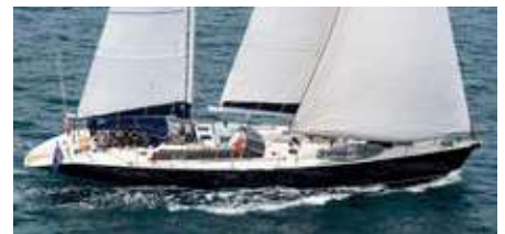
ENTHALPIA Garcia Aluminium Ketch 21.60m 1992, Refit 2015 Location: Marseille, South of France EUR 450 000