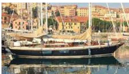
COIHUE Cuttyhunk 54 Ketch 18.28 m 1989, Refit 2018 Location: France, Nice EUR 390 000