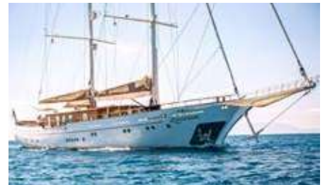
ZANZIBA Length: 40.00 m Guest/Crew: 10/7 Area: Turkey Rate: From EUR 69 300/week