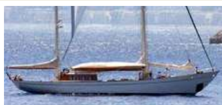
TAMORY Classic Wishbone Ketch 26.58 m 1952, Refit 1974 Location: Italy, Ventimiglia EUR 1 100 000