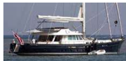
CORTO MALTESE Oceangoing Sloop 37.00 m 1982, Refit 2015 Location: Cannes, South of France EUR 5 900 000