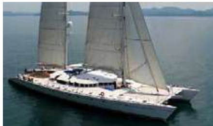
DOUCE FRANCE Length: 42.20 m Guest/Crew: 12/7 Area: Pacific Ocean Rate: From EUR 95 000/week