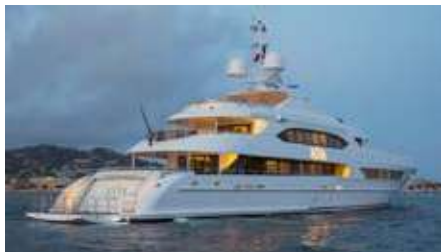
ASYA Heesen Yachts Built 47.00 m 2015 Location: West Mediterranean EUR 21 900 000