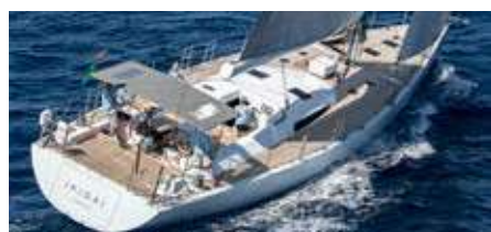
IKIGAI JFA 82 Sloop 25.13 m 2001, Refit 2018 Location: Palma, Spain EUR 3 100 000