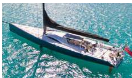
LEOPARD 3 Length: 30.50 m Guest/Crew: 8/6 Area: West Mediterranean Rate: From EUR 49 500/week