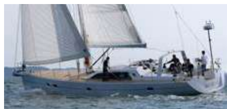
SWEET LIFE II Alliage DS 56 Centre Board 17.86 m 2007 Location: Sète, South of France EUR 530 000