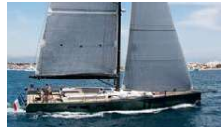
SHAMLOR Length: 20.42 m Guest/Crew: 6/2 Area: West Mediterranean Rate: From EUR 15 000/week