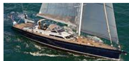
ANNKA I Garcia 75 23.72 m 2009 Location: Portimao, Portugal EUR 1 095 000