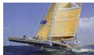
LAKOTA ex Orma 60 Groupe Pierre 1 er 18.28 m 1990 Location: Philippines EUR 250 000