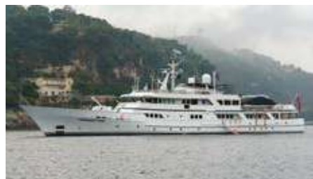
SANSOUCI STAR Steel/Aluminium Large Motor Yacht 53.53 m 1982 Location: Copenhagen, Denmark EUR 2 900 000