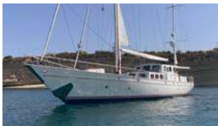
PROVENANCE Cold Moulded Ketch 29.65 m 1968, Refit 2019 Location: Palma EUR 1 000 000