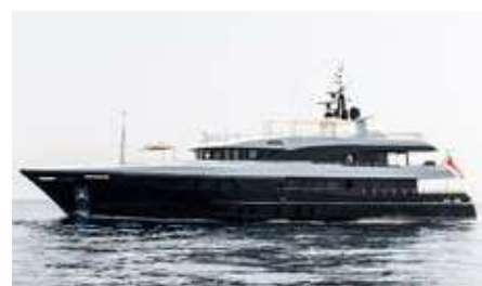
AMADEUS Length: 44.70 m Guest/Crew: 10/6 Area: West Mediterranean Rate: From EUR 140 000/week