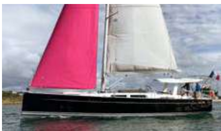
GARDEN Length: 17.20 m Guest/Crew: 6/2 Area: West Mediterranean Rate: From EUR 14 500/week