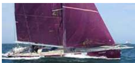
GLOBE Ex Imoca 60 18.28 m 1992 Location: Gdansk, Poland EUR 115 000