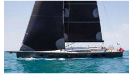
LUCE GUIDA Length: 23.60 m Guest/Crew: 8/2 Area: Caribbean Rate: From EUR 25 000/week