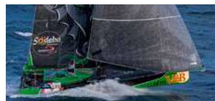
V AND B MAYENNE Imoca 60 18.28 m 2007/2019 Location: France, Saint-Brieuc EUR 950 000