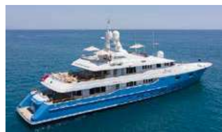
MOSAIQUE Length: 49.90 m Guest/Crew: 12/12 Area: Caribbean Rate: From EUR 160 000/week