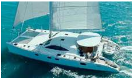
LAYSAN Length: 21.95 m Guest/Crew: 8/3 Area: Caribbean Rate: From EUR 35 000/week