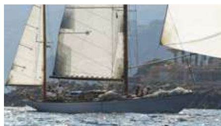
GIANNELLA II Yawl Marconi Sangermani 64 19.64 m 1966 Location: Palma, Spain EUR 750 000