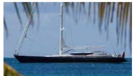
THANDEKA Length: 37.00 m Guest/Crew: 8/6 Area: Caribbean Rate: From EUR 85 000/week