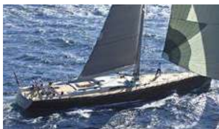
ARAGON Length: 28.64 m Guest/Crew: 8/4 Area: West Mediterranean Rate: From EUR 40 000/week