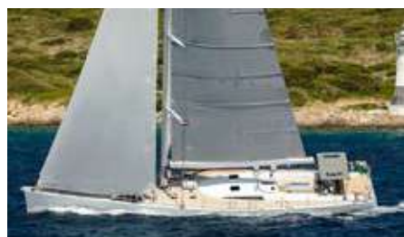
IKIGAI Length: 25.13 m Guest/Crew: 8/2 Area: Caribbean Rate: From EUR 28 000/week