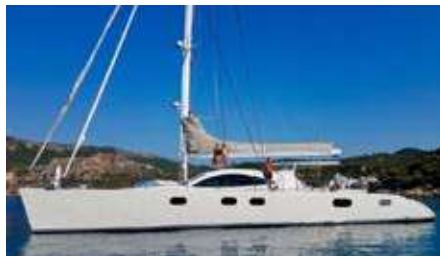
LAYSAN Prout 72 22.00 m 2017 Location: Carribean EUR 1 990 000