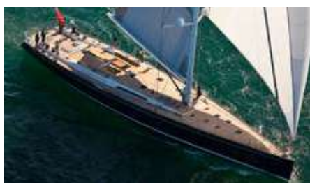
THALIMA Length: 33.70 m Guest/Crew: 8/5 Area: West Mediterranean Rate: From EUR 58 000/week