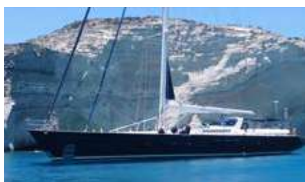
AMADEUS Length: 33.50 m Guest/Crew: 12/6 Area: Greece Rate: From EUR 35 000/week