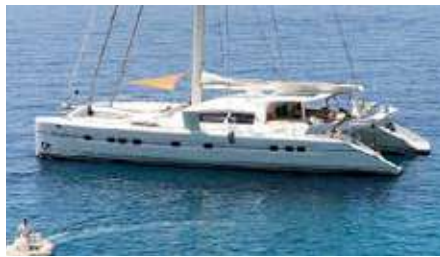
ORION Catana 90 26.52 m 2008, Refit 2020 Location: Caribbean, Curaçao EUR 2 060 000