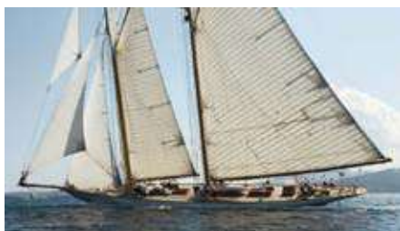
ELEONORA Classic Gaff Schooner 49.50 m 2000, Refit 2020 Location: Tarragona, Spain EUR 6 900 000