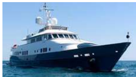
BERZINC Camper & Nicholson's Design 44.68 m 1977, Refit 2012 Location: West Mediterranean EUR 3 600 000