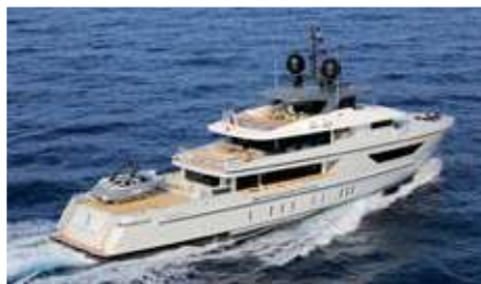
X Length: 42.19 m Guest/Crew: 12/7 Area: West Mediterranean Rate: From EUR 195 000/week