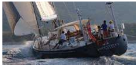
FIFTY FIFTY CNB 76 23.16 m 1991, Refit 2021 Location: Palma, Spain EUR 750 000