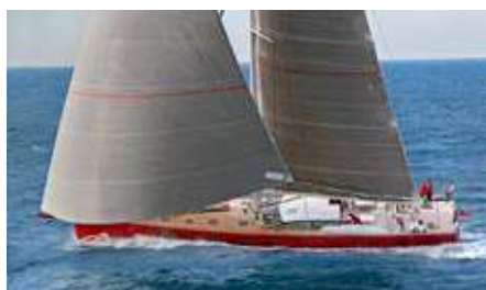
NOMAD IV Length: 30.48 m Guest/Crew: 12/4 Area: Pacific Ocean Rate: From EUR 56 000/week