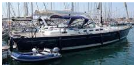
ARION Beneteau 57 17.60 m 2006 Location: Hyères, South of France EUR 349 000