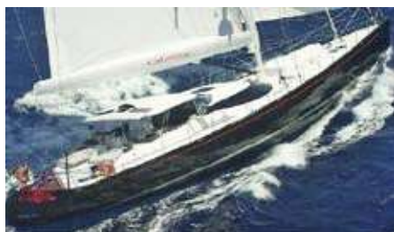
BLISS Length: 36.70 m Guest/Crew: 10/5 Area: West Mediterranean Rate: T.B.C.