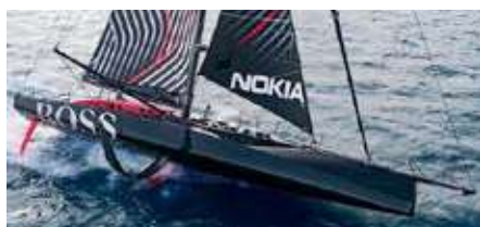
HUGO BOSS Imoca 60 18.28 m 2019 Location: England, Gosport P.O.A.