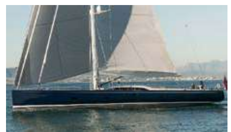
FARFALLA Length: 31.78 m Guest/Crew: 8/5 Area: Bergen, Norway Rate: From EUR 65 000/week