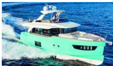
MAYBE 5 Length: 17.00 m Guest/Crew: 6/2 Area: Balearic Islands Rate: From EUR 16 500/week