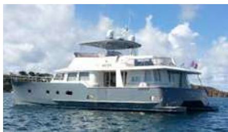
TELSTAR V Trawler Bamba 50 14.98 m 2009, Refit 2015 Location: France, Port-La-Forêt EUR 499 000