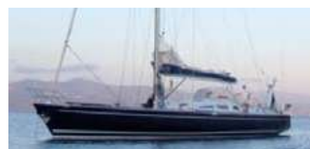
L'ILE NUE Gilles Vaton 78ft sloop 23.66 m 1988, Refit 2014 Location: France, Port Saint Louis du Rhône EUR 400 000