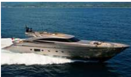
MUSA Length: 36.25 m Guest/Crew: 9/5 Area: West Mediterranean Rate: From EUR 75 000/week