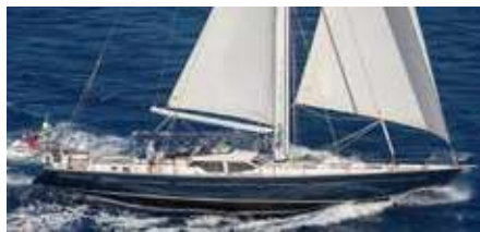
TOAD Oyster 70 21.14 m 1996, Refit 2021 Location: Imperia, Italy EUR 730 000