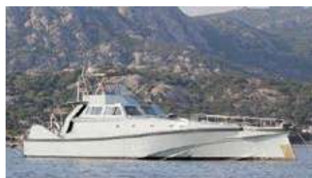
ENMER Setton/ Safehaven Marine 23.00 m 2019 Location: Porto Cervo, Sardinia EUR 1 450 000