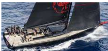
BLACK LEGEND S Mylius Cruiser-racer 18.23 m 2013 Location: Monaco EUR 1 200 000