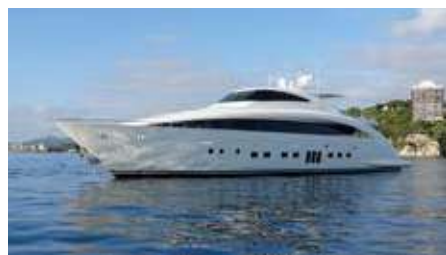
IL GATTOPARDO Amer 116 S 36.00 m 2012 Location: Barcelona, Spain EUR 5 900 000