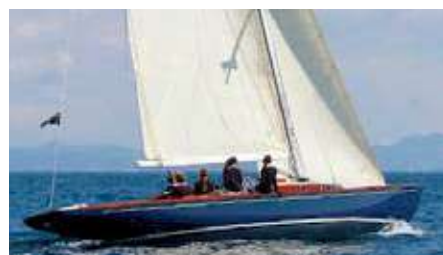
ILHABELA II Fractional Sloop 14.15 m 2005, Refit 2018 Location: France, Fréjus EUR 330 000