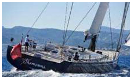
SHAMANNA Length: 35.20 m Guest/Crew: 8/6 Area: West Mediterranean Rate: From EUR 90 000/week