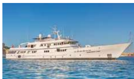
SANSSOUCI STAR Length: 53.50 m Guest/Crew: 12/8 Area: Northern Europe Rate: From EUR 100 000/week