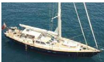
TIGA BELAS Length: 24.59 m Guest/Crew: 8/2 Area: West Mediterranean Rate: From EUR 22 000/week