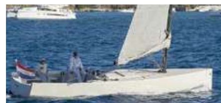
FRESET Setton 32 Custom 9.76 m 2012 Location: France, Antibes EUR 345 000