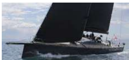
HIGH SPIRIT Botin 65 20.00 m 2015 Location: Valencia, Spain EUR 1 500 000