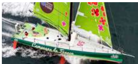
CAMPAGNE DE FRANCE Imoca 60 18.28 m 2006 Location: Cherbourg, France EUR 450 000