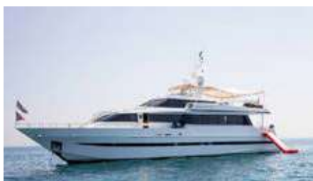
HEARTBEAT OF LIFE Heesen Yachts 28.20 m 1989, Refit 2008 Location: Barcelona, Spain EUR 1 100 000