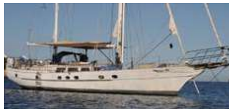
TARA BAY Scorpio 72 21.60 m 1991, Refit 2020 Location: Marseille, South of France EUR 295 000