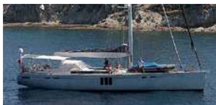
DYNASTY Hanse 630 19.80 m 2007 Loc: Port St Louis du Rhône, South of France EUR 430 000