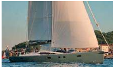
ICTHUS Length: 21.75 m Guest/Crew: 6/2 Area: West Mediterranean Rate: From EUR 14 000/week