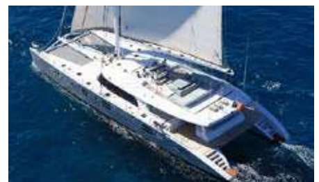
CHE Length: 34.70 m Guest/Crew: 8/6 Area: West Mediterranean Rate: From EUR 75 000/week