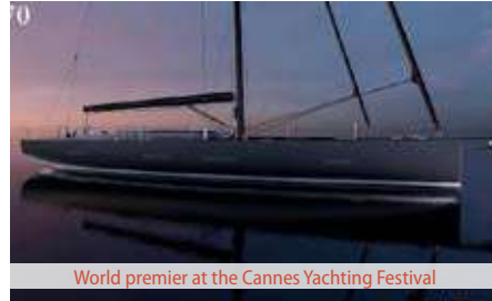
World premier at the Cannes Yachting Festival

ICECAT sixtyfour 2022 19.50 m New - Sold by her Shipyard Location: Italy P.O.A.