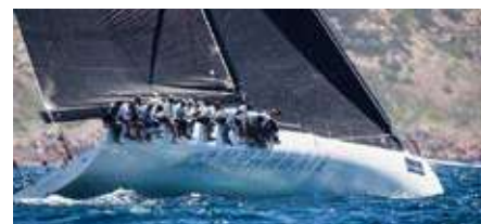
CANNONBALL Bottin Partner Maxi 72 21.90 m 2017 Location: Palma, Spain P.O.A.