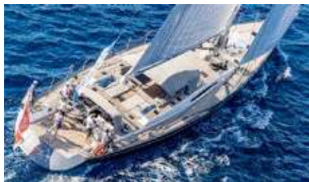
FREEBIRD Length: 30.20 m Guest/Crew: 8/4 Area: Caribbean Rate: From EUR 48 000/week