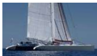
OCEAN PEARL Maxi Catamaran 33.50 m 2000 Location: Barcelona, Spain EUR 1 950 000