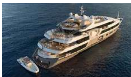
SERENITY Length: 72.00 m Guest/Crew: 28/30 Area: West Mediterranean Rate: From EUR 550 000/week