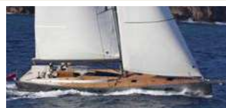
AEGIR Carbon Ocean 82 25.00 m 2011 Location: Palma, Spain EUR 2 900 000