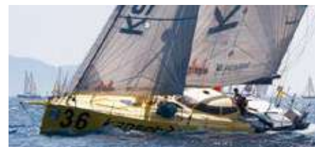
AUSTRIA ONE Ex Imoca 60 18.28 m 1995/2012 Location: Split, Croatia EUR 175 000