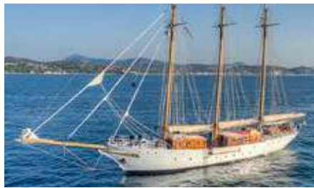
TRINAKRIA Length: 49.06 m Guest/Crew: 10/8 Area: West Mediterranean Rate: From EUR 65 000/week