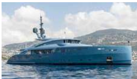
PHYLMX ISA Shipyard Build 43.00 m 2014 Location: Nice, France EUR 9 900 000