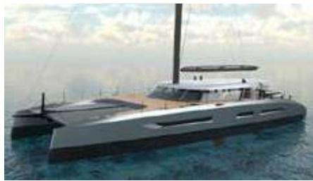
ICECAT seventytwo Cruising catamaran 22.00 m 2022 Location: Italy P.O.A.