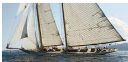
ELEONORA Classic Gaff Schooner 49.50 m 2000, Refit 2020 Location: Tarragona, Spain EUR 6 900 000