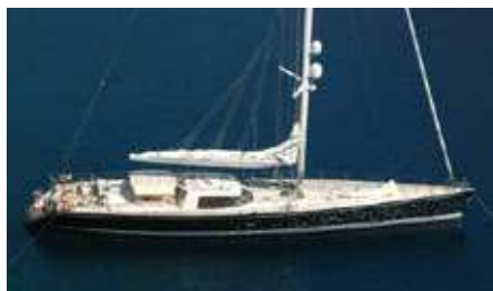
VAIMITI Length: 39.20 m Guest/Crew: 10/5 Area: West Mediterranean Rate: From EUR 41 140/week