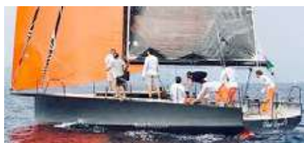
BLACK LEGEND 2 Black Pepper Code 1 12.00 m 2013 Location: France, Port Grimaud EUR 345 000