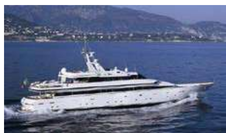
COSTA MAGNA Length: 44.50 m Guest/Crew: 10/8 Area: West Mediterranean Rate: From EUR 90 000/week