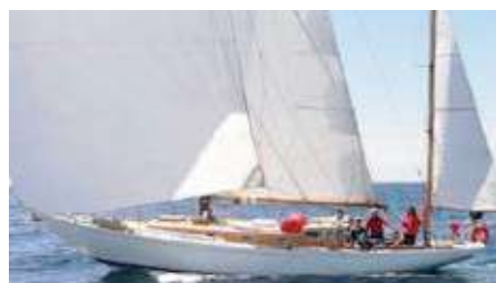
WESTWARD OF CLYNDER Bermudian Yawl 13.20 m 1959 Location: France, Hendaye EUR 125 000