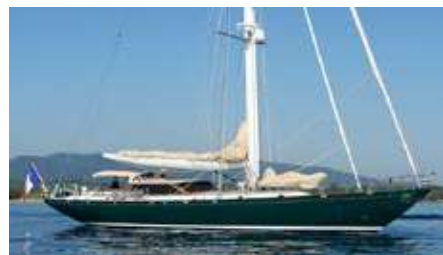
WHIRLWIND 90ft Holland Jachtbouw 28.50 m 1998 Location: Port Camargue, France EUR 875 000