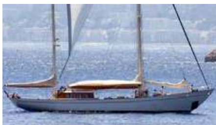
TAMORY Classic Wishbone Ketch 26.58 m 1952, Refit 1974 Location: Italy, Ventimiglia EUR 1 100 000