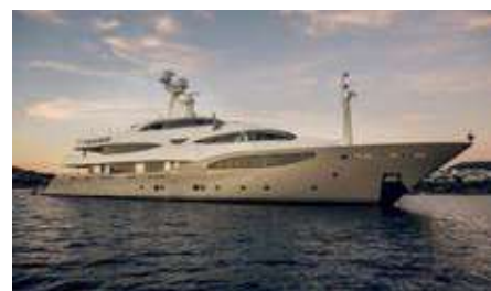
LIGHT HOLIC Length: 60.00 m Guest/Crew: 12/15 Area: West Mediterranean Rate: From EUR 320 000/week