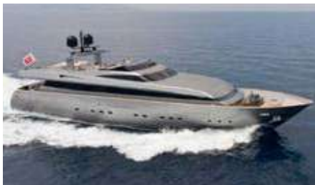
IROCK Length: 34.00 m Guest/Crew: 11/6 Area: West Mediterranean Rate: From EUR 84 000/week