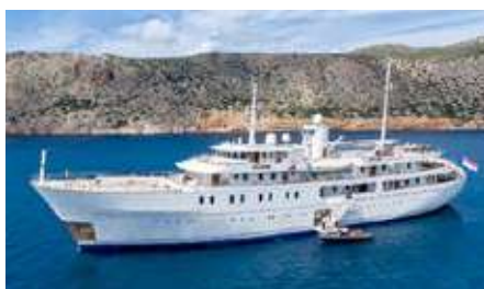
SHERAKHAN Length: 69.60 m Guest/Crew: 26/19 Area: West Mediterranean Rate: From EUR 425 000/week