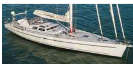
FANI Garcia 85 26.33 m 2005, Refit 2020 Location: France, Saint-Malo EUR 1 300 000