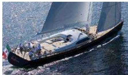
FARANWIDE Length: 30.20 m Guest/Crew: 8/4 Area: East/West Mediterranean Rate: From EUR 46 000/week