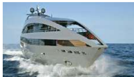
OCEAN SAPPHIRE Norman Foster Design 41.10 m 2010 Location: Cannes, South of France EUR 5 900 000