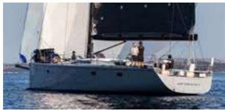
ARAGON Reichel Pugh 72 22.00 m 2006 Location: Palma, Spain EUR 992 000