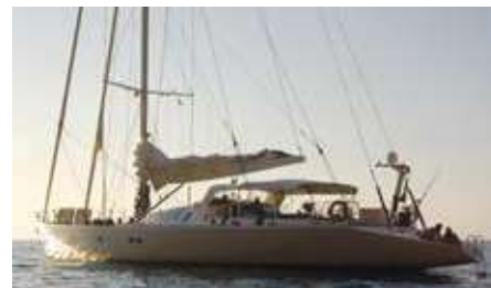
AIZU Length: 30.00 m Guest/Crew: 8/3 Area: West Mediterranean Rate: From EUR 31 000/week