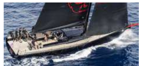
BLACK LEGEND S Mylius Cruiser-racer 18.23 m 2013 Location: Monaco EUR 1 200 000