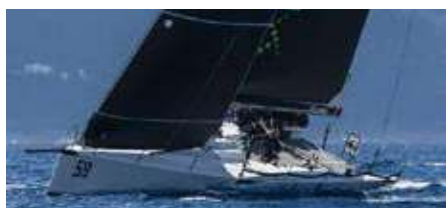
MACCHIA MEDITERRANEA TP52 15.84 m 2008 Location: Gaeta, Italy EUR 360 000