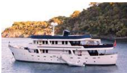
DONA DEL MARE New Classic 34.10 m 2006 Location: Croatia EUR 3 990 000