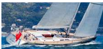
ELISE WHISPER SW 78 23.99 m 2001 Location: Italy EUR 1 550 000