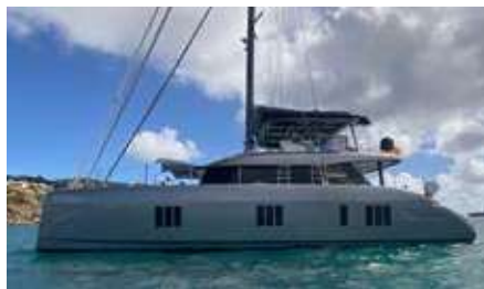
CALMA Length: 18.40 m Guest/Crew: 10/3 Area: Caribbean Rate: From USD 40 000/week