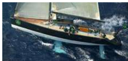
KALAO Maxi Dolphin 65 - 2 20.00 m 2003 Location: Antibes, South of France EUR 690 000