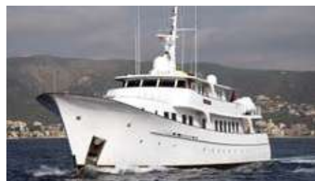
KRISS Abeking & Rasmussen Built 45.00 m 1974, Refit 2017 Location: Malta P.O.A.