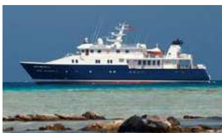
HANSE EXPLORER Length: 47.76 m Guest/Crew: 12/14 Area: Spitzbergen | Bergen, Norway Rate: From EUR 135 000/week