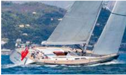
ELISE WHISPER Length: 23.99 m Guest/Crew: 8/3 Area: West Mediterranean Rate: From EUR 25 000/week