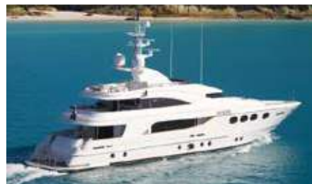
DE LISLE III Length: 42.00 m Guest/Crew: 8/5 Area: Australia - New Zealand Rate: From AUD 165 000/week