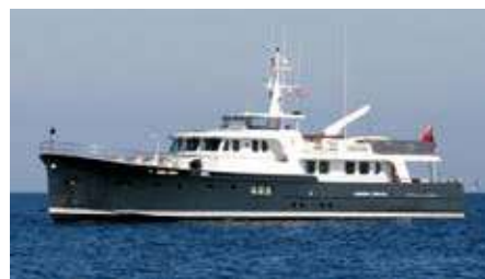
ALEXANDRIA Commuter 108 32.50 m 2013 Location: Barcelona, Spain EUR 1 690 000