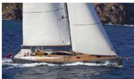
AEGIR Length: 25.10 m Guest/Crew: 6/3 Area: West Mediterranean Rate: From EUR 28 000/week