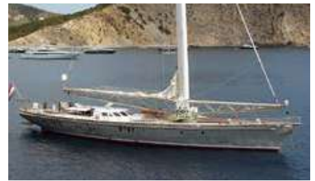
DWINGER Length: 48.50 m Guest/Crew: 11/7 Area: Northern Europe Rate: From EUR 70 000/week