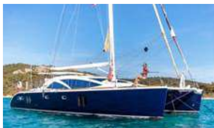
CURANTA CRIDHE Length: 15.35 m Guest/Crew: 6/2 Area: West Mediterranean Rate: From EUR 17 000/week