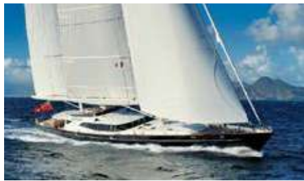
DRUMBEAT Length: 53.00 m Guest/Crew: 11/10 Area: Caribbean Rate: From EUR 175 000/week