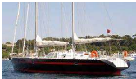
JAIPUR Centreboard Ketch 21.00 m 1991 Location: France, Cannes EUR 550 000