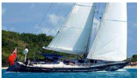
DARK STAR OF LONDON 90ft Aluminium centreboard sloop 27.50 m 1982, Refit 2016 Location: France, Near Marseille EUR 705 000