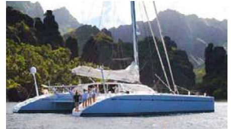
MAGIC CAT Fast Cruising Catamaran 25.00 m 1996, Refit 2020 Location: Sète, South of France P.O.A.