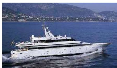
COSTA MAGNA Length: 44.50 m Guest/Crew: 10/8 Area: West Mediterranean Rate: From EUR 90 000/week