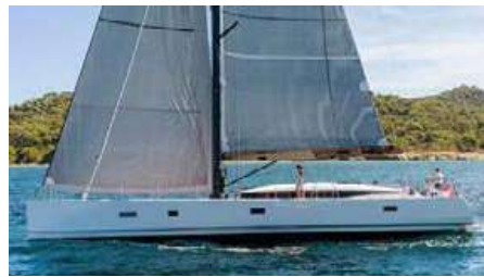
WINK CNB 76 - Hull n°2 23.17 m 2014 Location: France, Sète EUR 1 850 000