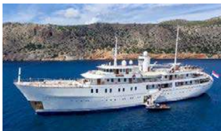
SHERAKHAN Length: 69.60 m Guest/Crew: 26/19 Area: West Mediterranean Rate: From EUR 485 000/week