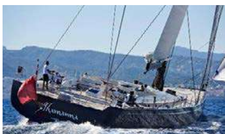
SHAMANNA Length: 35.20 m Guest/Crew: 8/6 Area: West Mediterranean Rate: From EUR 105 000/week