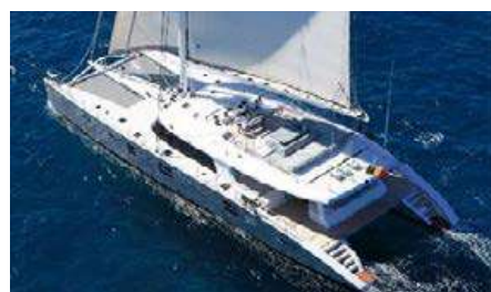
CHE Length: 34.70 m Guest/Crew: 8/6 Area: West Mediterranean Rate: From EUR 75 000/week