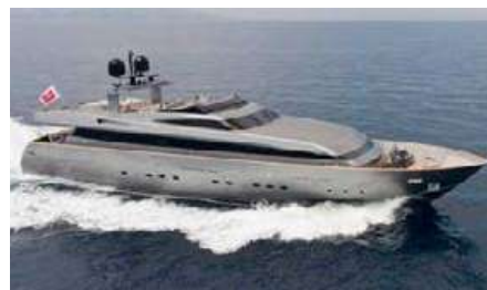
IROCK Length: 34.00 m Guest/Crew: 11/6 Area: West Mediterranean Rate: From EUR 84 000/week