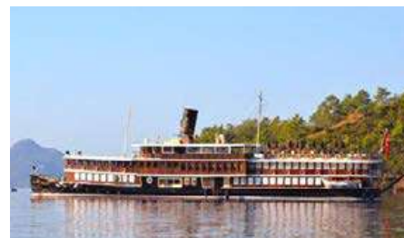
HALAS Length: 52.00 m Guest/Crew: 24/16 Area: Turkey Rate: From EUR 140 000/week