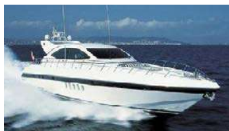
HALKIN Mangusta 72 21.56 m 1999 Location: Alassio, Italy EUR 430 000