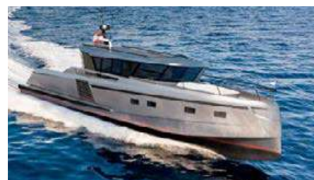
BIC ALUMINIUM 48C C48 14.66 m 2021 Location: Latvia, Riga EUR 1196 700