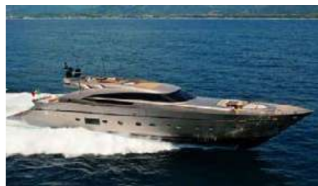
MUSA Length: 36.25 m Guest/Crew: 9/5 Area: West Mediterranean Rate: From EUR 75 000/week