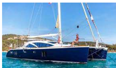
CURANTA CRIDHE Length: 15.35 m Guest/Crew: 6/2 Area: West Mediterranean Rate: From EUR 17 000/week