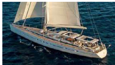
SAVARONA Aluminium Lifting Keel Sloop 28.60 m 2001, Refit 2021 Location: St Marteen Caribbean EUR 2 500 000