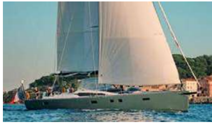
ICTHUS Futuna 70 21.75 m 2010 Location: Marseille, South of France EUR 1 215 000