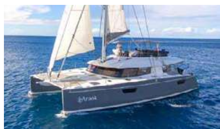
ARAOK Length: 17.80 m Guest/Crew: 6/2 Area: West Mediterranean Rate: From EUR 24 000/week