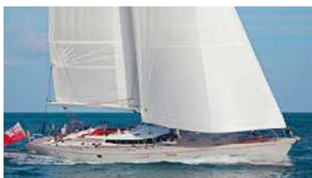
SWALLOWS AND AMAZONS Custom CNB 77 23.70 m 2009, Refit 2020 Location: Caribbean, Antigua EUR 1 190 000