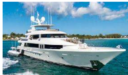
PIPE DREAM Length: 39.62 m Guest/Crew: 12/7 Area: Caribbean Rate: From EUR 129 000/week