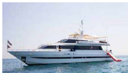
HEARTBEAT OF LIFE Heesen Yachts 28.20 m 1989, Refit 2008 Location: Barcelona, Spain EUR 1 100 000