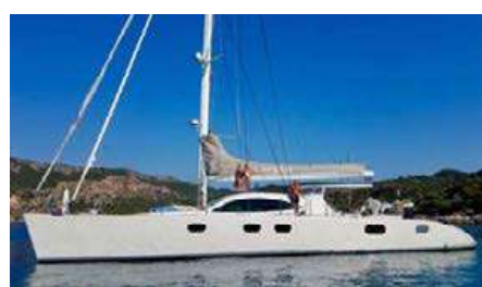
LAYSAN Length: 22.00 m Guest/Crew: 8/3 Area: US Virgin Islands Rate: From USD 39 000/week