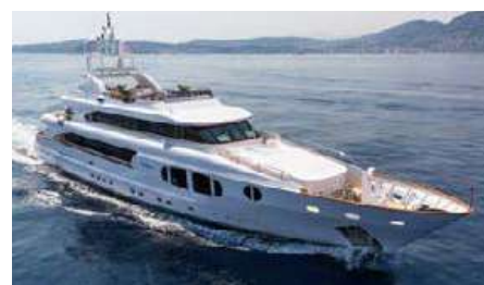
BINA Length: 43.25 m Guest/Crew: 12/9 Area: West Mediterranean Rate: From EUR 150 000/week