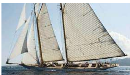
ELEONORA Classic Gaff Schooner 49.50 m 2000, Refit 2020 Location: Tarragona, Spain EUR 6 900 000