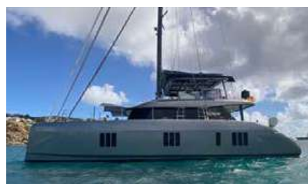
CALMA Length: 18.40 m Guest/Crew: 10/3 Area: TBC Rate: TBC