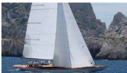
JOUR DE FETE Q Class Classic Bermudian Sloop 15.80 m 1930 Refit 2007 & 2017 Location: Marseille EUR 390 000