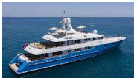
MOSAIQUE Length: 49.90 m Guest/Crew: 12/12 Area: West Mediterranean Rate: From EUR 160 000/week