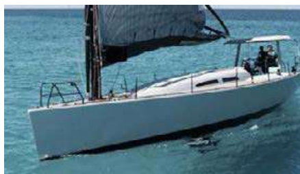
WATER MAIDEN Cat-Rigged Sailing Yacht 13.90 m 2008 Location: St Carlos de la Rapita Spain EUR 145 000