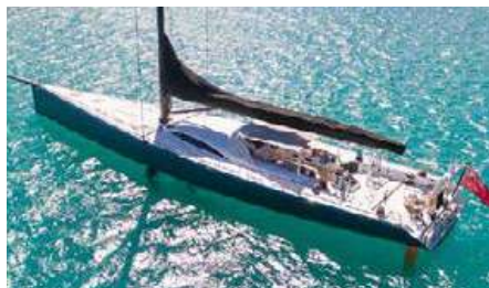
LEOPARD 3 Length: 30.00 m Guest/Crew: 8/6 Area: West Mediterranean Rate: From EUR 49 500/week