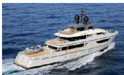
X Length: 42.78 m Guest/Crew: 12/8 Area: West Mediterranean Rate: From EUR 175 000/week