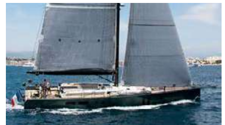
SHAMLOR Nacira 67 20.42 m 2012 Location: Olbia Sardinia Italy EUR 1 500 000