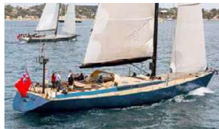
WALLY ONE Length: 25.30 m Guest/Crew: 6/4 Area: West Mediterranean Rate: From EUR 28 000/week