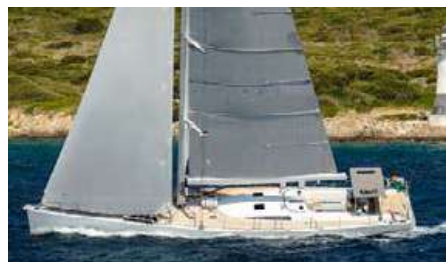
IKIGAI Length: 25.13 m Guest/Crew: 8/2 Area: West Mediterranean Rate: From EUR 28 000/week