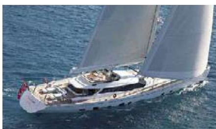
TWILIGHT Length: 38.10 m Guest/Crew: 8/6 Area: East Mediterranean Rate: From EUR 88 000/week