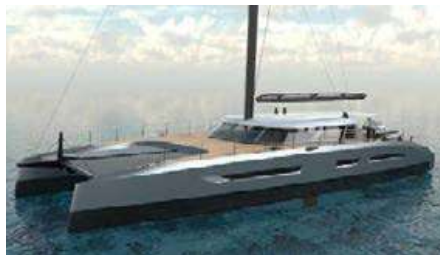
ICECAT seventytwo Cruising catamaran 22.00 m 2022 Location: Italy P.O.A.