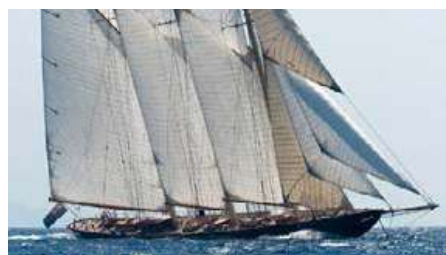
ATLANTIC New Classic Schooner Replica 64.50 m 2010 Location: La Seyne sur Mer, South of France P.O.A.