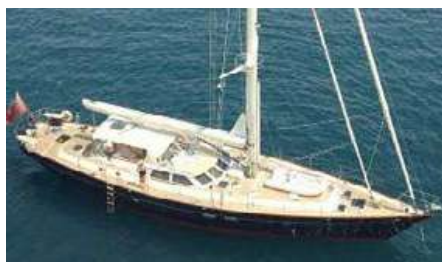
TIGA BELAS Length: 24.59 m Guest/Crew: 8/2 Area: West Mediterranean Rate: From EUR 22 000/week