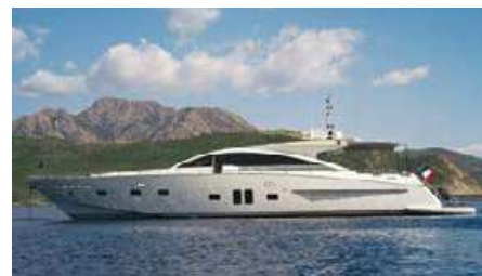
NOE Guy Couach 2800 Open 28.60 m 2013 Location: France, Saint Mandrier EUR 3 900 000