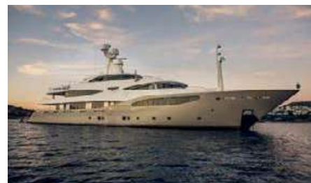
LIGHT HOLIC Length: 60.00 m Guest/Crew: 12/15 Area: West Mediterranean Rate: From EUR 320 000/week