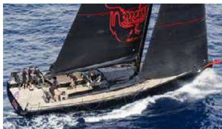
BLACK LEGEND S Mylius Cruiser-racer 18.23 m 2013 Location: Monaco EUR 1 200 000