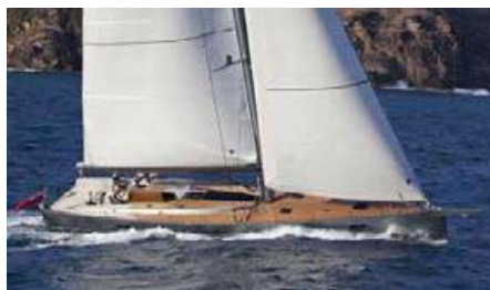
AEGIR Length: 25.10 m Guest/Crew: 6/3 Area: West Mediterranean Rate: From EUR 29 400/week