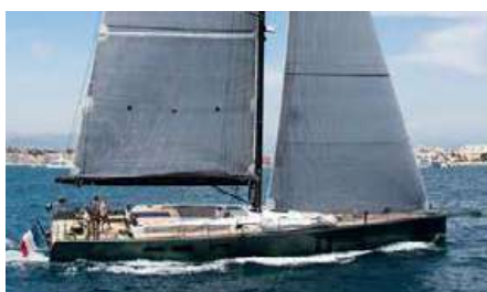
SHAMLOR Length: 20.42 m Guest/Crew: 6/2 Area: West Mediterranean Rate: From EUR 15 000/week