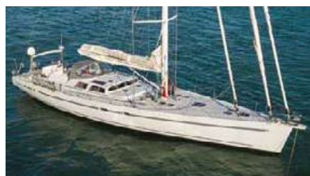
FANI Garcia 85 26.33 m 2005, Refit 2020 Location: France, Saint-Malo EUR 1 195 000