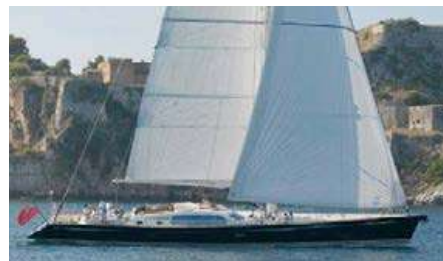
GRAND BLEU VINTAGE Length: 29.00 m Guest/Crew: 8/4 Area: West Mediterranean Rate: From EUR 39 000/week