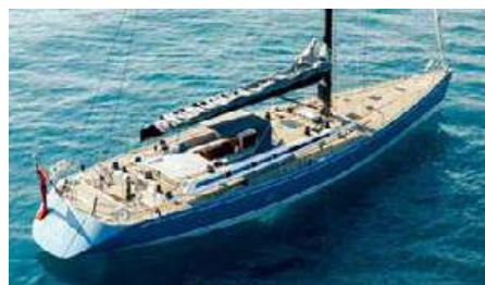
KALLIMA Length: 24.89 m Guest/Crew: 8/3 Area: West Mediterranean Rate: From EUR 30 000/week