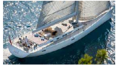
VIDELLE Felci 71 Performance 21.60 m 2006 Location: Italy, Cala Galera EUR 950 000