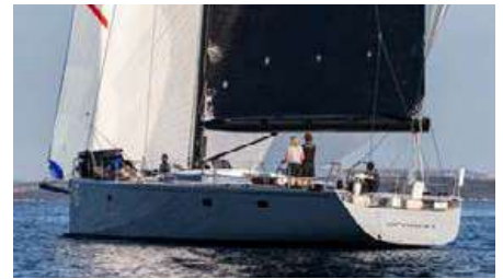
ARAGON Reichel Pugh 72 22.00 m 2006 Location: Palma, Spain EUR 992 000