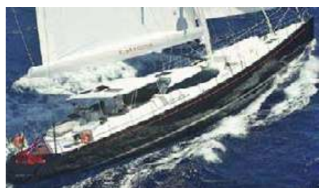
BLISS Length: 36.70 m Guest/Crew: 10/5 Area: West Mediterranean Rate: From EUR 72 500/week