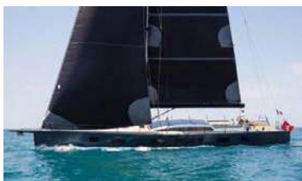
LUCE GUIDA Length: 23.60 m Guest/Crew: 6/2 Area: West Mediterranean Rate: From EUR 25 000/week