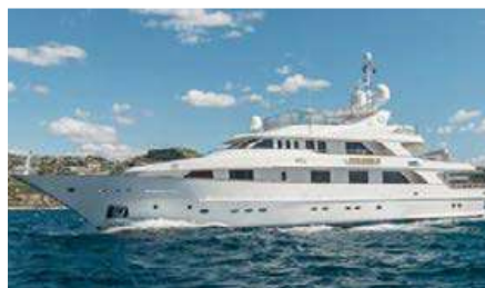
DESAMIS B Length: 40.00 m Guest/Crew: 11/8 Area: West Mediterranean Rate: From EUR 96 000/week