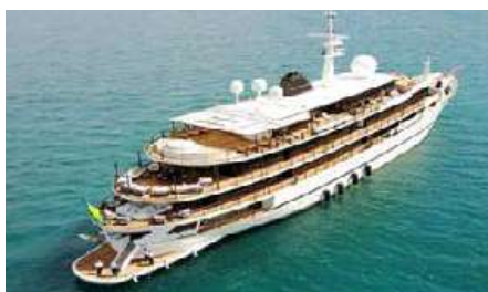
CHAKRA Length: 86.00 m Guest/Crew: 24/30 Area: East Mediterranean Rate: From EUR 495 000/week