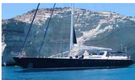
AMADEUS Length: 33.50 m Guest/Crew: 12/6 Area: Greece Rate: From EUR 35 000/week