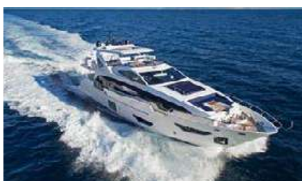
MEMORIES TOO Length: 30.00 m Guest/Crew: 12/6 Area: Greece, Turkey Rate: From EUR 92 000/week