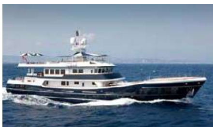
THE MERCY BOYS Length: 48.60 m Guest/Crew: 12/11 Area: East/West Mediterranean Rate: From EUR 90 000/week