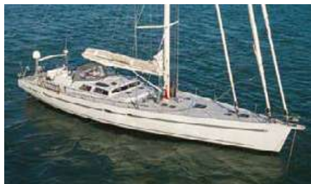
FANI Length: 26.33 m Guest/Crew: 12/2 Area: West Mediterranean Rate: From EUR 22 000/week