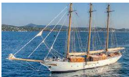
TRINAKRIA Length: 49.06 m Guest/Crew: 10/8 Area: West Mediterranean Rate: From EUR 65 000/week