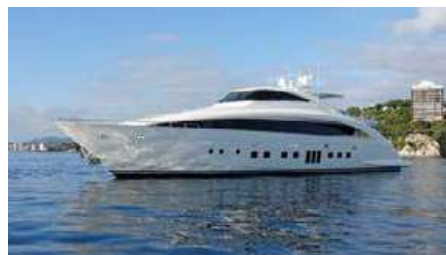
IL GATTOPARDO Amer 116 S 36.00 m 2012 Location: Barcelona, Spain EUR 4 900 000