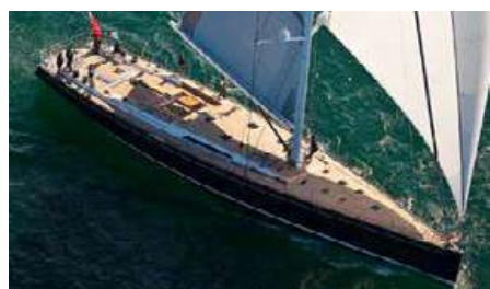
THALIMA Length: 33.70 m Guest/Crew: 8/5 Area: West Mediterranean Rate: From EUR 58 000/week