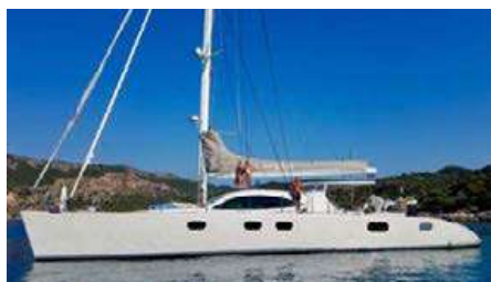
LAYSAN Prout 72 22.00 m 2017 Location: Carribean EUR 1 990 000