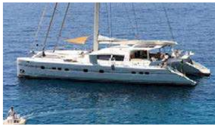
ORION Catana 90 26.52 m 2008, Refit 2020 Location: Caribbean, Curaçao EUR 2 060 000