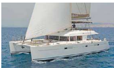
MELITI Length: 17.07 m Guest/Crew: 10/3 Area: Greece Rate: From EUR 16 000/week