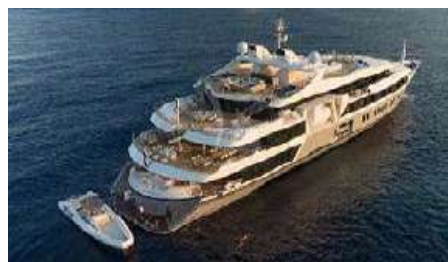
SERENITY Length: 72.00 m Guest/Crew: 28/30 Area: West Mediterranean Rate: From EUR 550 000/week