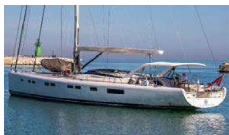
NAKUPENDA Length: 24.00 m Guest/Crew: 8/3 Area: West Mediterranean Rate: From EUR 28 000/week