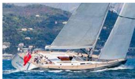
ELISE WHISPER Length: 23.99 m Guest/Crew: 8/3 Area: West Mediterranean Rate: From EUR 28 000/week