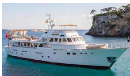
ODYSSEY III Length: 33.00 m Guest/Crew: 8/6 Area: West Mediterranean Rate: From EUR 54 000/week