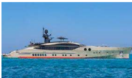
DB9 Length: 52.40 m Guest/Crew: 12/11 Area: West Mediterranean Rate: From EUR 250 000/week