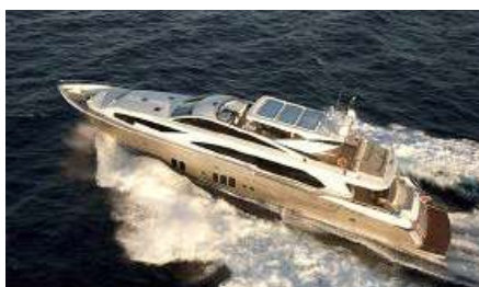
ASCENSION Length: 37.00 m Guest/Crew: 10/5 Area: West Mediterranean Rate: From EUR 100 000/week