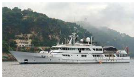
SANSSOUCI STAR Steel/Aluminium Large Motor Yacht 53.53 m 1982 Location: Flensburg, Germany EUR 2 250 000