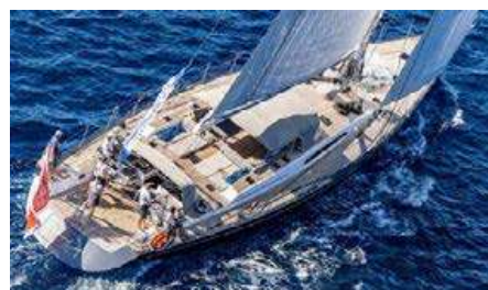
FREEBIRD Length: 30.20 m Guest/Crew: 8/4 Area: West Mediterranean Rate: From EUR 48 000/week