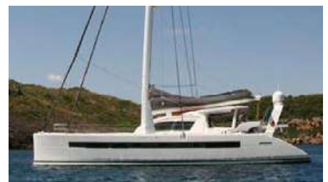
TRAMONTANE Catana 65 19.70 m 2008, Refit 2021 Location: Gruissan, South of France EUR 1 350 000