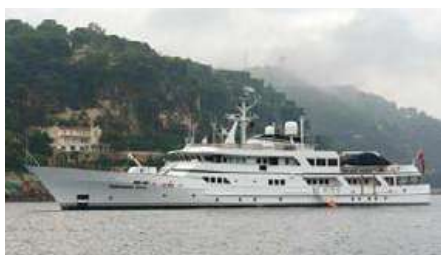
SANSSOUCI STAR Steel/Aluminium Large Motor Yacht 53.53 m 1982 Location: Copenhagen, Denmark EUR 2 250 000