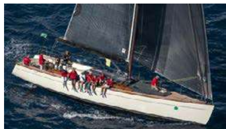
TOFINOU Tofinou 16 15.90 m 2022 Location: Port Camargue, South of France P.O.A.