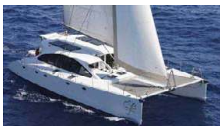
FRIENDS FOREVER DH 550 16.75 m 2016 Location: Portimao, Portugal EUR 665 000