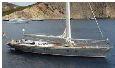
DWINGER Length: 48.50 m Guest/Crew: 11/7 Area: Northern Europe Rate: From EUR 70 000/week