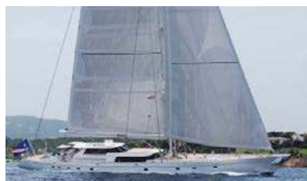
HYPERION Length: 47.42 m Guest/Crew: 6/8 Area: West Mediterranean Rate: From EUR 91 000/week