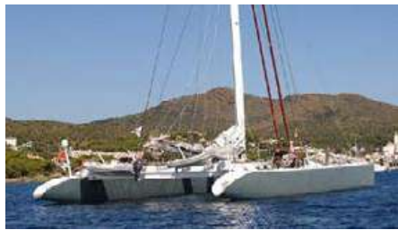
OCEAN PEARL Maxi Catamaran 33.50 m 2000 Location: Barcelona, Spain EUR 1 600 000