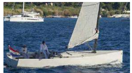
FRESET Setton 32 Custom 9.76 m 2012 Location: France, Antibes EUR 129 000