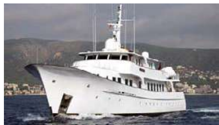
KRIISS Abeking & Rasmussen Built 45.00 m 1974, Refit 2017 Location: Malta P.O.A.