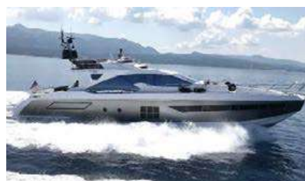
MAKANI Length: 23.60 m Guest/Crew: 9/4 Area: Greece Rate: From EUR 36 000/week