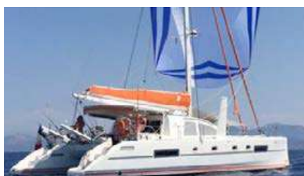
KALI Catana 50 15.23 m 2007 Location: France, Marseille EUR 595 000