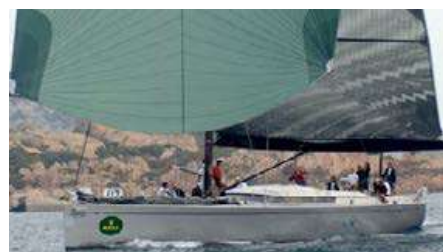
SILANDRA V Swan 76 23.20 m 2007, Refit 2021/2022 Location: Imperia Italy EUR 3 500 000