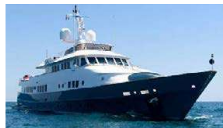
BERZINC Camper & Nicholson's Design 44.68 m 1977, Refit 2012 Location: West Mediterranean EUR 3 600 000