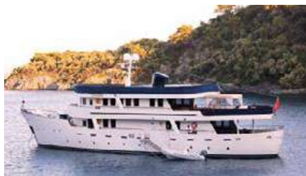
DONA DEL MARE New Classic 34.10 m 2006 Location: Croatia EUR 3 990 000