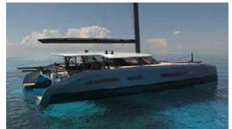
ICECAT sixtyfour Cruising catamaran 19.50 m 2022 Location: Italy P.O.A.