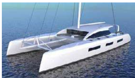
GP 70 GP 70 21.00 m 2022 Location: Portugal P.O.A.