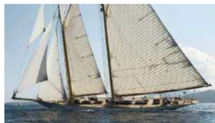
ELEONORA Classic Gaff Schooner 49.50 m 2000, Refit 2020 Location: Tarragona, Spain EUR 6 900 000