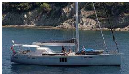
DYNASTY Hanse 630 19.80 m 2007 Loc: Port St Louis du Rhône, South of France EUR 430 000