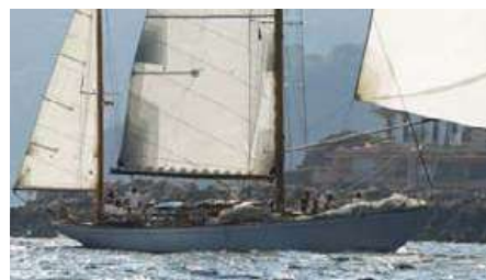
GIANNELLA II Yawl Marconi Sangermani 64 19.64 m 1966 Location: Palma, Spain EUR 495 000