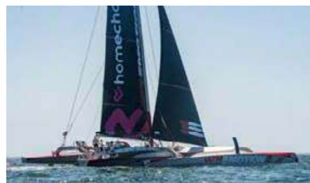
ULTIM EMOTION 2 Length: 24.38 m Guest/Crew: 8/3 Area: West Mediterranean Rate: From EUR 42 000/week