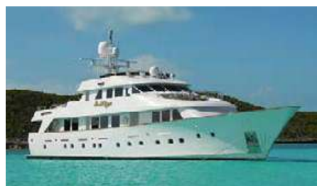
SWEET ESCAPE Length: 39.62 m Guest/Crew: 12/8 Area: Bahamas Rate: From USD 99 000/week