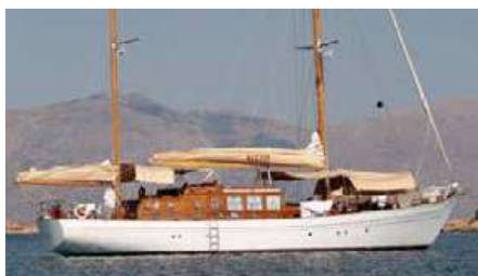
AITOR Laurent Gilles Ketch 21.75 m 1964, Refit 2017 Location: Sète, France EUR 460 000