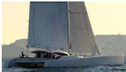
LORD DICKIE Velum 72 22.00 m 2009, Refit 2018 Location: Canet en Roussillon, South of France EUR 490 000