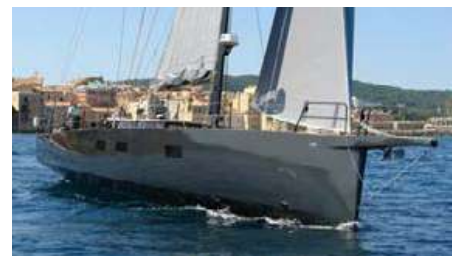
BLACK LEGEND 4 Black Pepper Code 2.1 17.40 m 2019 (New - Sold by her Shipyard) Location: Port Grimaud, South of France EUR 1 695 000