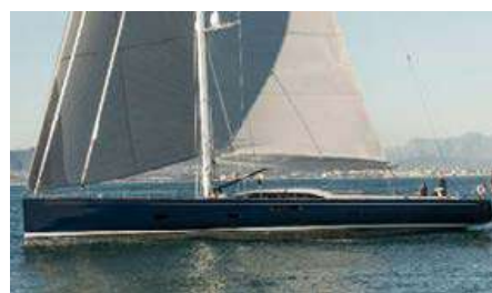
FARFALLA Length: 31.78 m Guest/Crew: 8/5 Area: Bergen, Norway Rate: From EUR 70 000/week