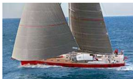
NOMAD IV Length: 30.48 m Guest/Crew: 12/6 Area: West Mediterranean Rate: From EUR 56 000/week