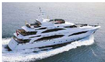
DIANE Length: 43.00 m Guest/Crew: 10/8 Area: West Mediterranean Rate: From EUR 140 000/week