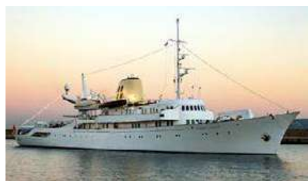
CHRISTINA O Length: 99.13 m Guest/Crew: 34/38 Area: West Mediterranean Rate: From EUR 620 000/week