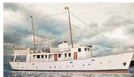
THEMARA Long Range Gentleman Motor Yacht 24.60 m 1962, Refit 2022 Location: Marseille, France EUR 950 000