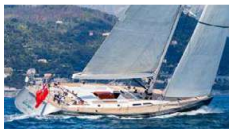
ELISE WHISPER SW 78 23.99 m 2001 Location: Italy EUR 1 550 000