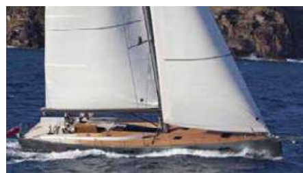
AEGIR Carbon Ocean 82 25.00 m 2011 Location: Palma, Spain EUR 2 900 000