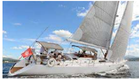
BELLA UNO Fast Cruising Sloop 21.88 m 1998 Location: Thailand, Phuket US$ 650 000