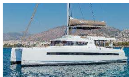
LICENSE TO CHILL Length: 16.80 m Guest/Crew: 10/2 Area: Greece Rate: From EUR 14 100/week