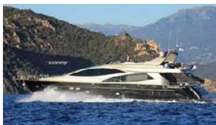
4 FIVE Riva Opera 85 26.02 m 2005 Location: Spain, Roses EUR 1 290 000