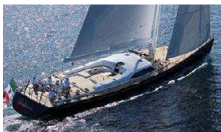
FARANDWIDE Length: 30.20 m Guest/Crew: 8/4 Area: East/West Mediterranean Rate: From EUR 46 000/week