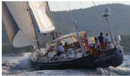
FIFTY FIFTY CNB 76 23.16 m 1991, Refit 2021 Location: Palma, Spain EUR 690 000