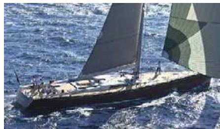
ARAGON Length: 28.64 m Guest/Crew: 8/4 Area: West Mediterranean Rate: From EUR 44 000/week