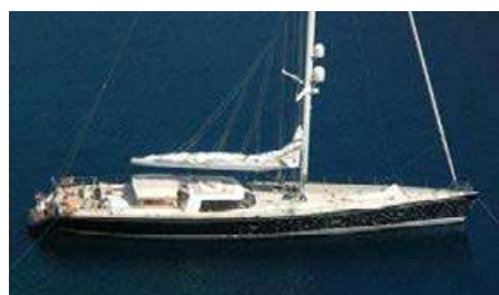
VAIMITI Length: 39.20 m Guest/Crew: 10/5 Area: West Mediterranean Rate: From EUR 41 140/week