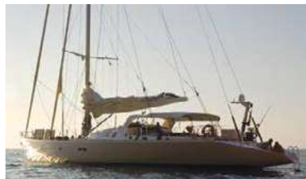
AIZU Length: 30.00 m Guest/Crew: 8/3 Area: East Mediterranean Rate: From EUR 31 000/week