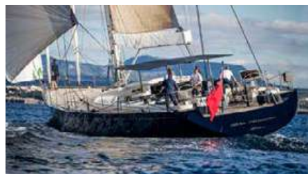
BLUE DIAMOND Bermudian Sloop 30.00 m 2004, Refit 2021 Location: Palma, Spain EUR 1 800 000