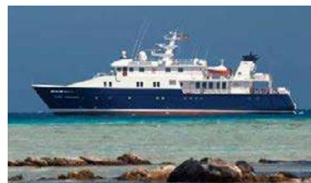
HANSE EXPLORER Length: 47.76 m Guest/Crew: 12/14 Area: Pacific Ocean Rate: From EUR 175 000/week