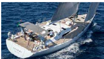
IKIGAI JFA 82 Sloop 25.13 m 2001, Refit 2018 Location: Palma, Spain EUR 2 800 000