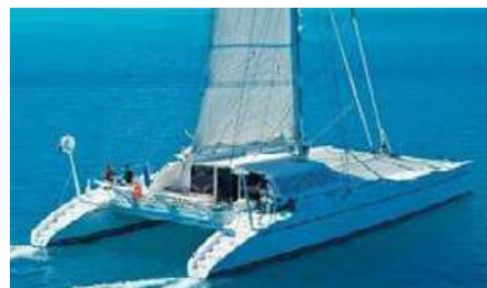
MAGIC CAT Length: 25.00 m Guest/Crew: 8/4 Area: West Mediterranean Rate: From EUR 35 000/week