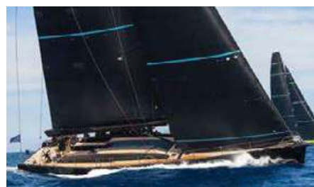
AESOP Length: 23.99 m Guest/Crew: 4/2 Area: West Mediterranean Rate: From EUR 30 000/week