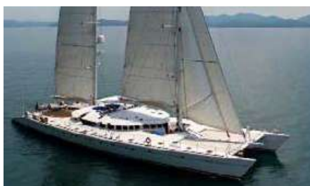
DOUCE FRANCE Length: 42.20 m Guest/Crew: 12/7 Area: West Mediterranean Rate: From EUR 106 000/week