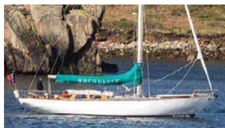
ROCQUETTE Camper and Nicholson racing sloop 12.88 m 1964, Refit 2019 Location: France, Brittany EUR 115 000