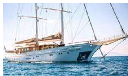
ZANZIBA Length: 40.00 m Guest/Crew: 10/7 Area: Croatia, Montenegro Rate: From EUR 69 300/week