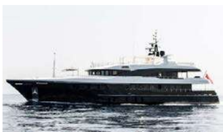
AMADEUS Length: 44.05 m Guest/Crew: 10/9 Area: West Mediterranean Rate: From EUR 106 500/week