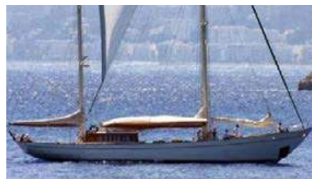
TAMORY Classic Wishbone Ketch 26.58 m 1952, Refit 1974 Location: Italy, Ventimiglia EUR 790 000