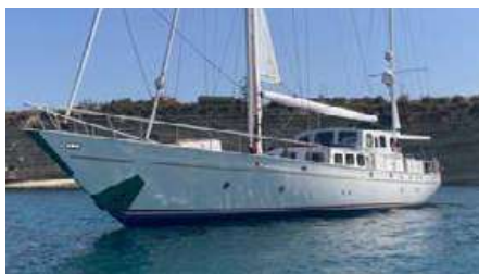
PROVENANCE Cold Moulded Ketch 29.65 m 1968, Refit 2019 Location: Palma EUR 1 000 000