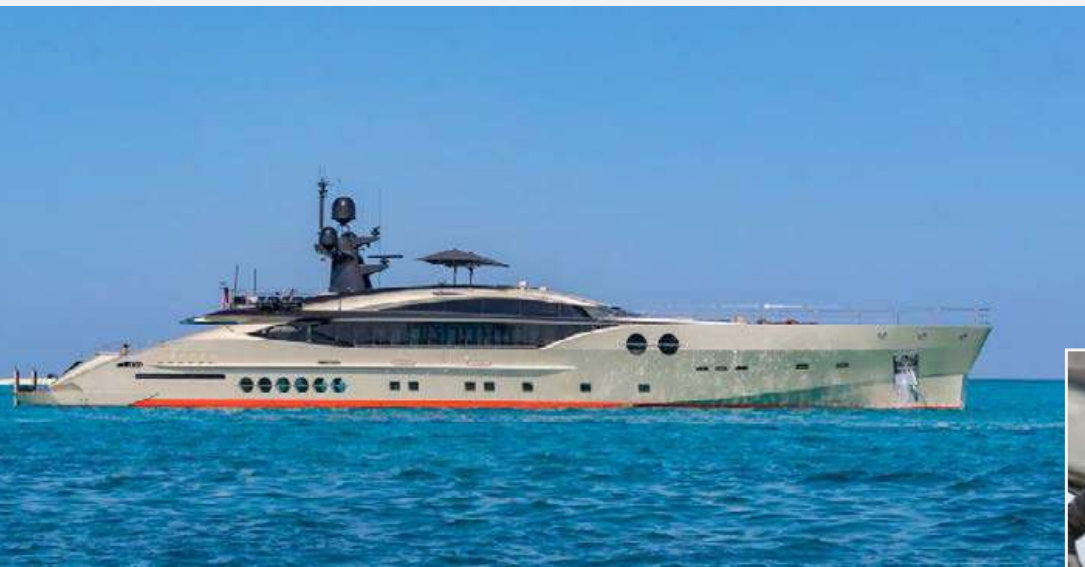
Charter DB9 Superyacht in Western Mediterranean