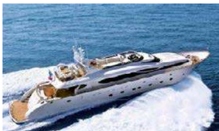
PARIS A Length: 35.05 m Guest/Crew: 12/6 Area: Greece Rate: From EUR 63 000/week