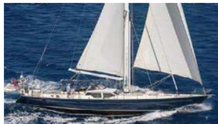
TOAD Oyster 70 21.14 m 1996, Refit 2021 Location: Imperia, Italy EUR 730 000