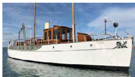
KIWI Motor Gentleman's Yacht 18.30 m 1914 Location: France, Sète EUR 135 000