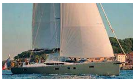
ICTHUS Length: 21.75 m Guest/Crew: 6/2 Area: West Mediterranean Rate: From EUR 15 000/week