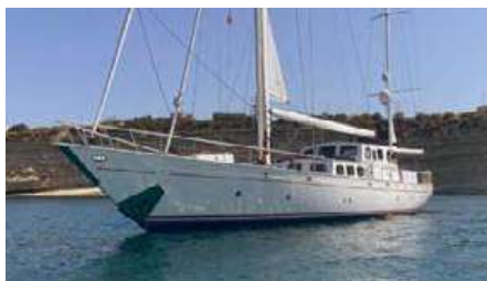
PROVENANCE Cold Moulded Ketch 29.65 m 1968, Refit 2019 Location: Palma EUR 1 000 000