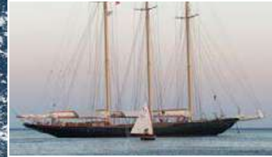
Atlantic, page 11