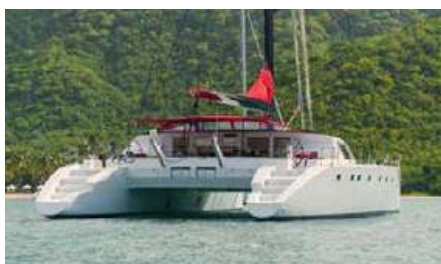
TAJ Length: 24.00 m Guest/Crew: 6/3 Area: Caribbean Rate: From EUR 27 000/week