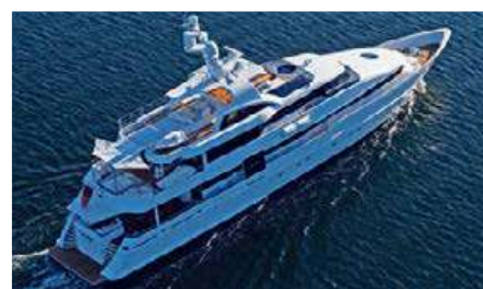
LIFE SAGA Length: 42.10 m Guest/Crew: 12/8 Area: Caribbean Rate: From EUR 90 000/week