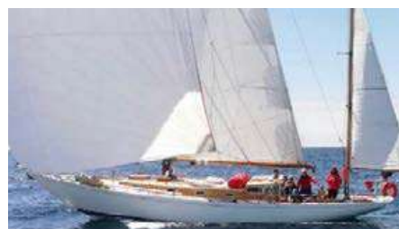
WESTWARD OF CLYNDER Bermudian Yawl 13.20 m 1959 Location: France, Hendaye EUR 125 000