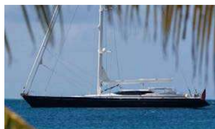
THANDEKA Length: 37.00 m Guest/Crew: 8/6 Area: Caribbean Rate: From EUR 85 000/week