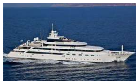
TITANIA Length: 73.00 m Guest/Crew: 12/19 Area: West Mediterranean Rate: From EUR 565 000/week