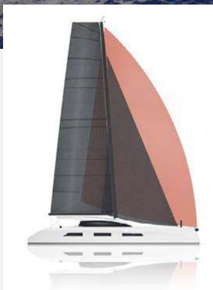
Rendering Linea Concept

The hulls and superstructure are ready to be put together, waiting for you to take the GP 70 over and to adapt her to your own wishes.