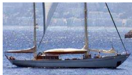
TAMORY Classic Wishbone Ketch 26.58 m 1952, Refit 1974 Location: Italy, Ventimiglia EUR 790 000