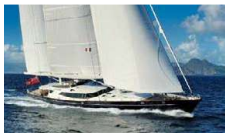
DRUMBEAT Length: 53.00 m Guest/Crew: 11/10 Area: Caribbean Rate: From EUR 175 000/week