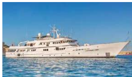
SANSSOUCI STAR Length: 53.50 m Guest/Crew: 12/8 Area: Northern Europe Rate: From EUR 100 000/week